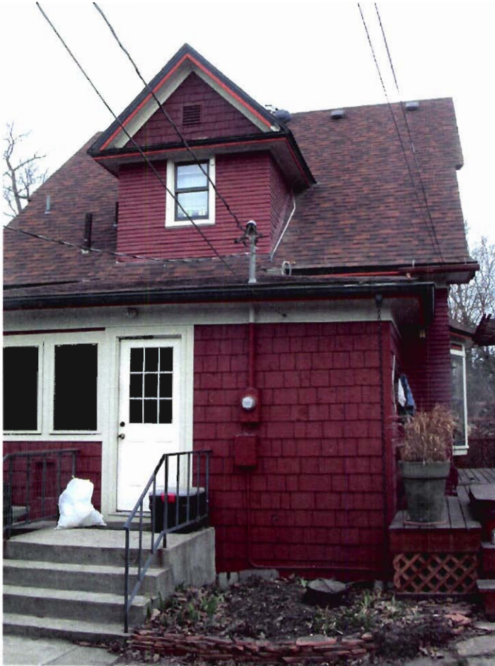
REAR PORCH & DORMER (TO BE REMOVED)