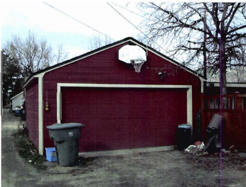
EXISTING GARAGE & PARKING AREA FROM ALLEY

RECEIVED MAR 28 2008 DEVELOPMENT SERVICES