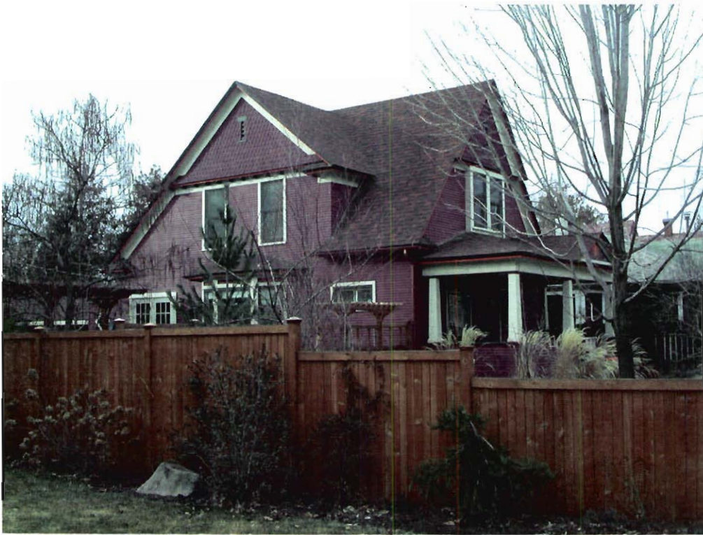
EXISTING RESIDENCE & FENCELINE LOOKING NW

RECEIVED MAR 28 2008 DEVELOPMENT SERVICES