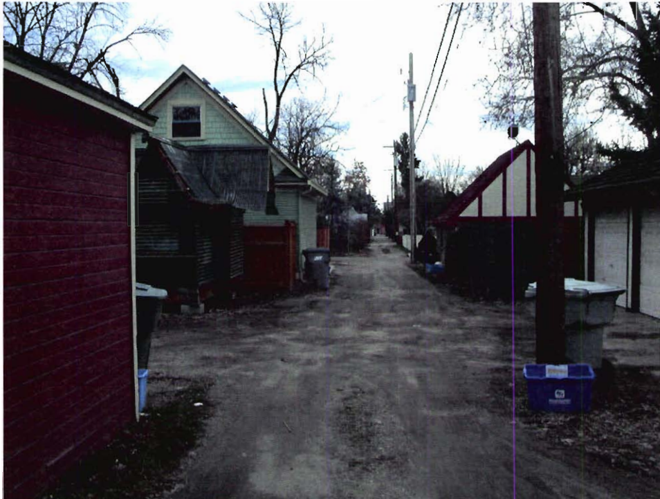
LOOKING S DOWN ALLEY – EXISTING GARAGE