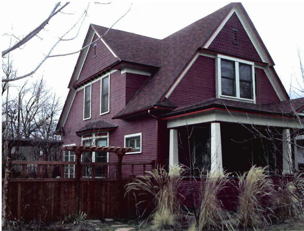
EXISTING RESIDENCE FROM SE