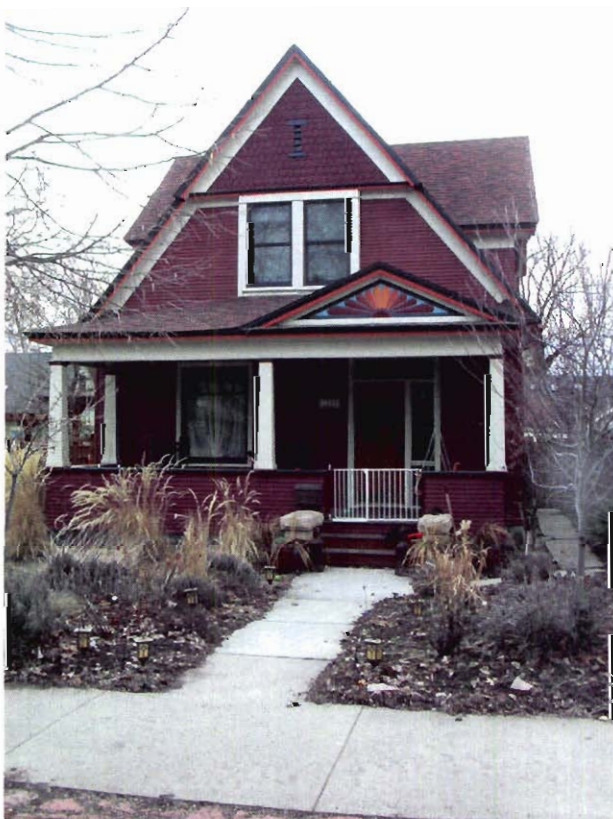
EXISTING RESIDENCE FROM 16 TH STREET