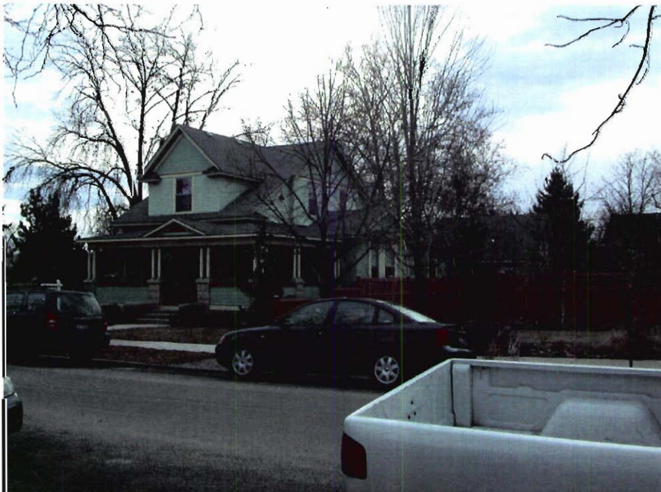
ADJACENT HOME ON S SIDE LOOKING SW ACROSS 16 TH STREET

RECEIVED MAR 28 2003 DEVELOPMENT SERVICE