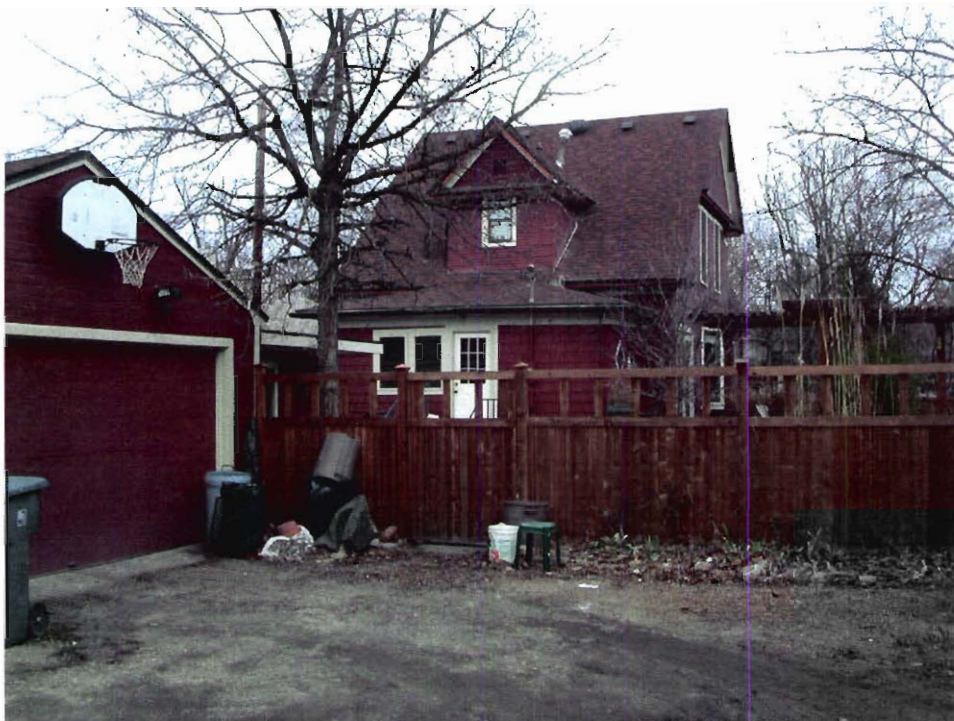
EXISTING GARAGE AND REAR OF HOUSE FROM ALLEY

RECEIVED MAR 28 2008 DEVELOPMENT SERVICES