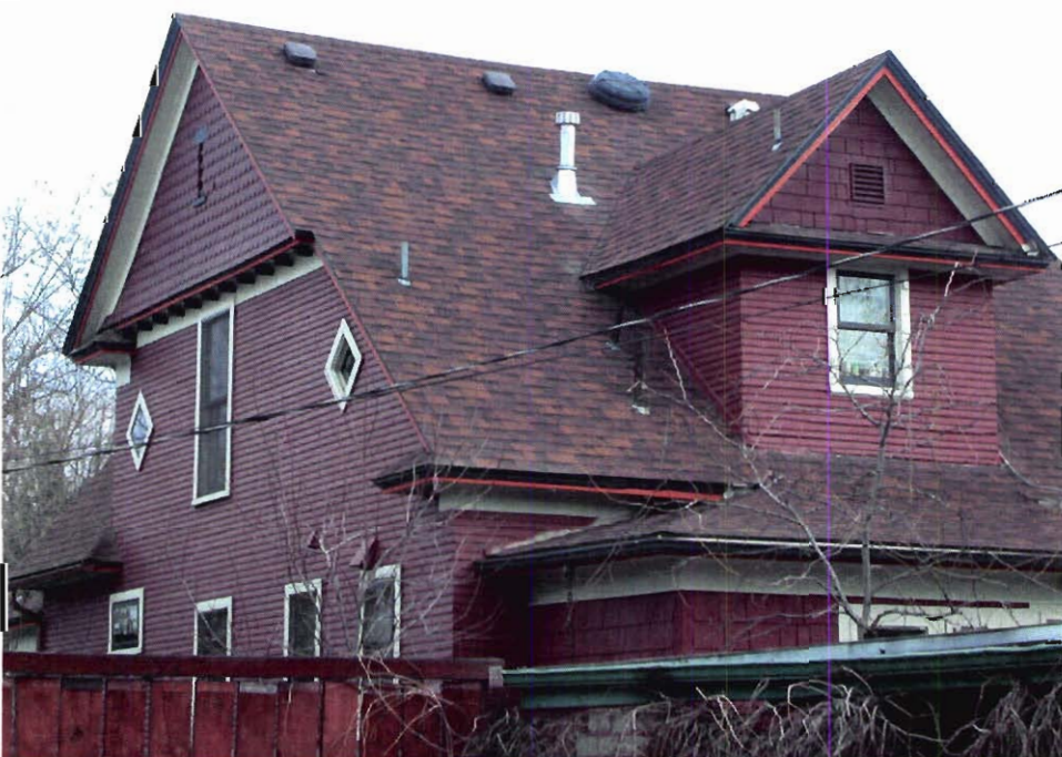
REAR OF EXISTING HOUSE FROM NW