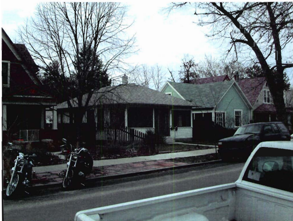
ADJACENT HOMES TO THE NORTH LOOKING NW ACROSS 16 TH STREET