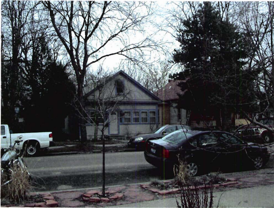
LOOKING SE ACROSS 16 TH STREET