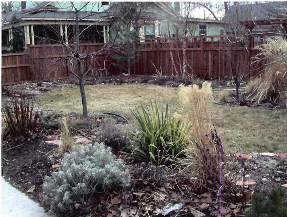
VIEW OF FRONT YARD FROM 16 TH STREET LOOKING SW