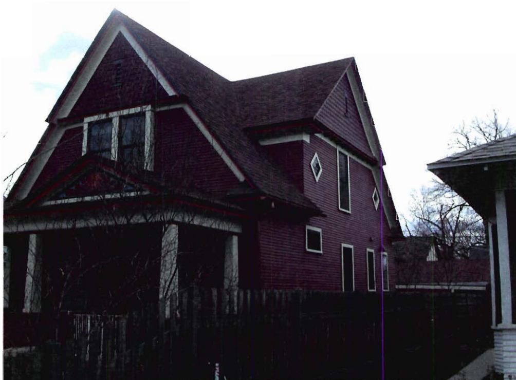
EXISTING RESIDENCE FROM NE