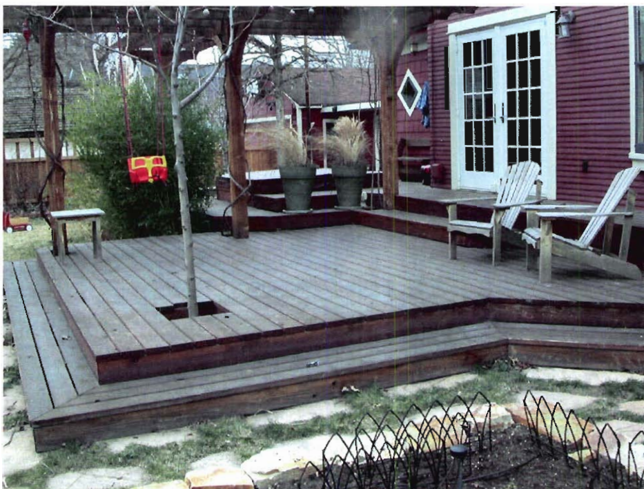
EXISTING DECK AND SIDE YARD FROM SE