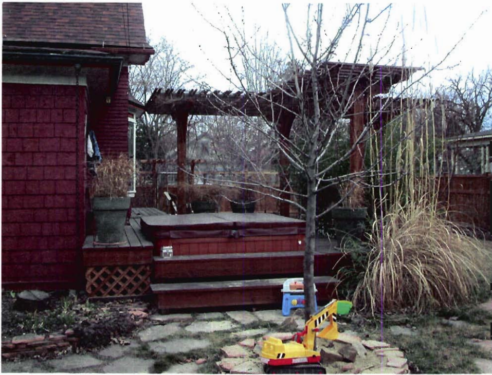
EXISTING DECK AND SIDE YARD LOOKING EAST