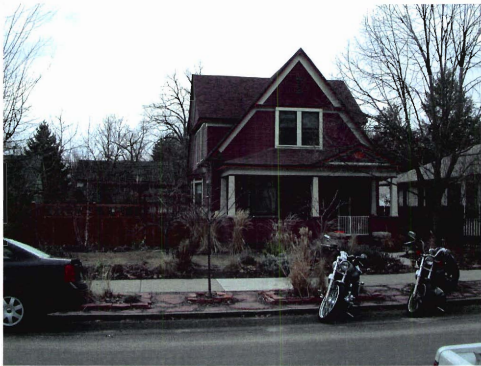
RESIDENCE & SITE LOOKING W ACROSS 16 TH STREET