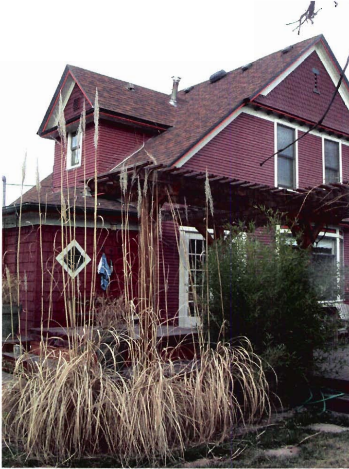
REAR OF HOUSE & YARD FROM SW