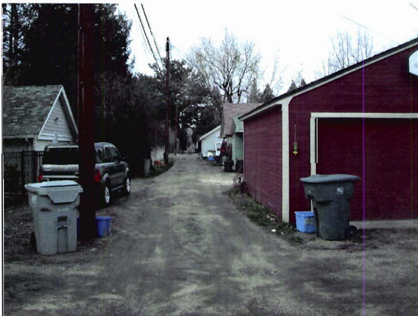
LOOKING N UP ALLEY - EXISTING GARAGE

RECEIVED MAR 28 2008 DEVELOPMENT SERVICES