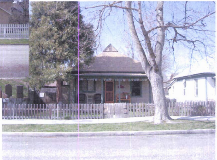
Property to the North