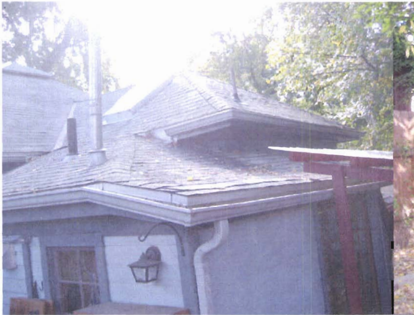
West section of house to be rebuilt, roof/ceiling raised with new roof peak to match existing main roof height.