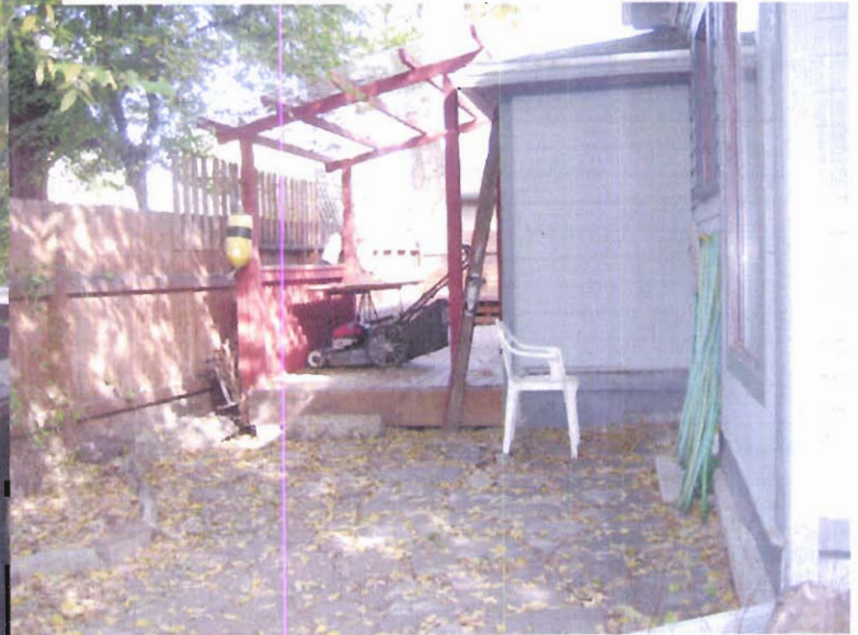
West section of house to be removed, including deck and overhead structure. New addition to be brought out in line with existing southernmost wall.