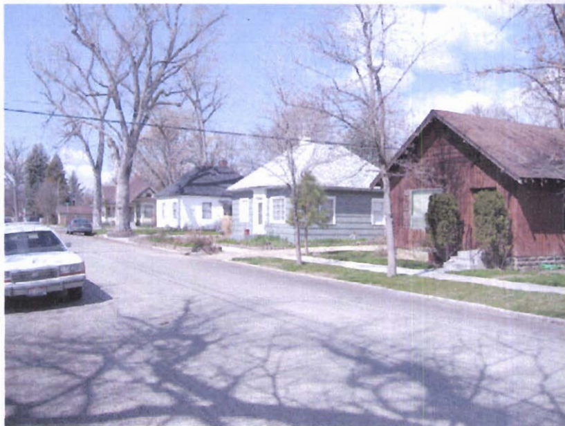
Looking west along Sherman