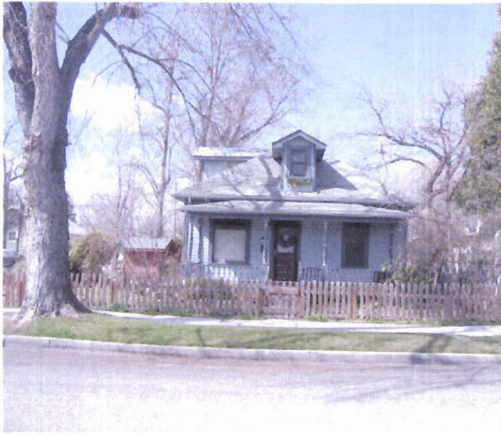
East/10th Street elevation