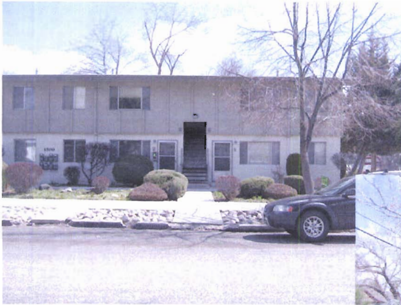
Property to the East