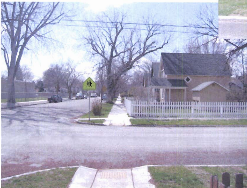
Property to the South