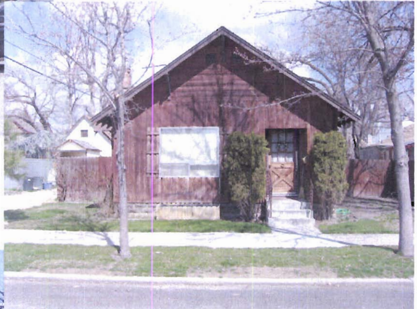
Property to the West