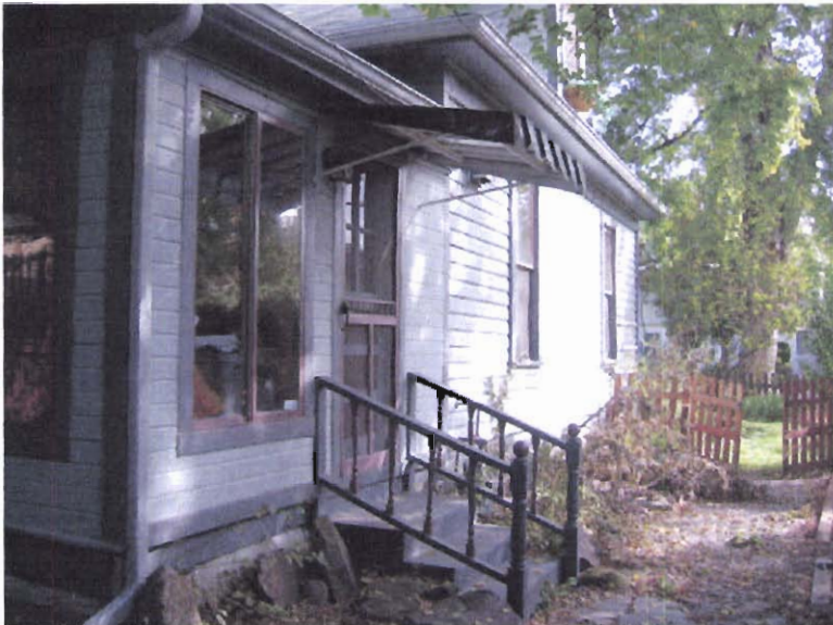
South side - new porch and rebuilding of west section