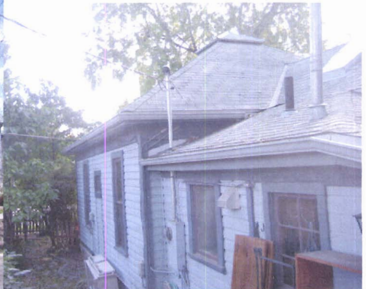
North Elevation - interior side