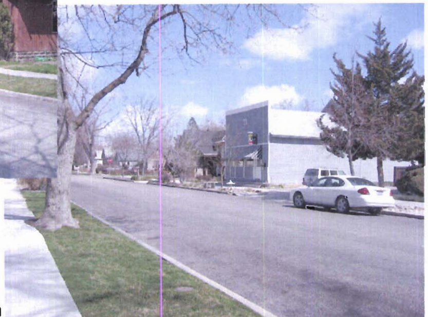
Looking northeast along 10th