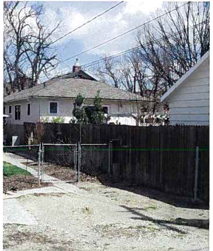
Across alley in back of home.