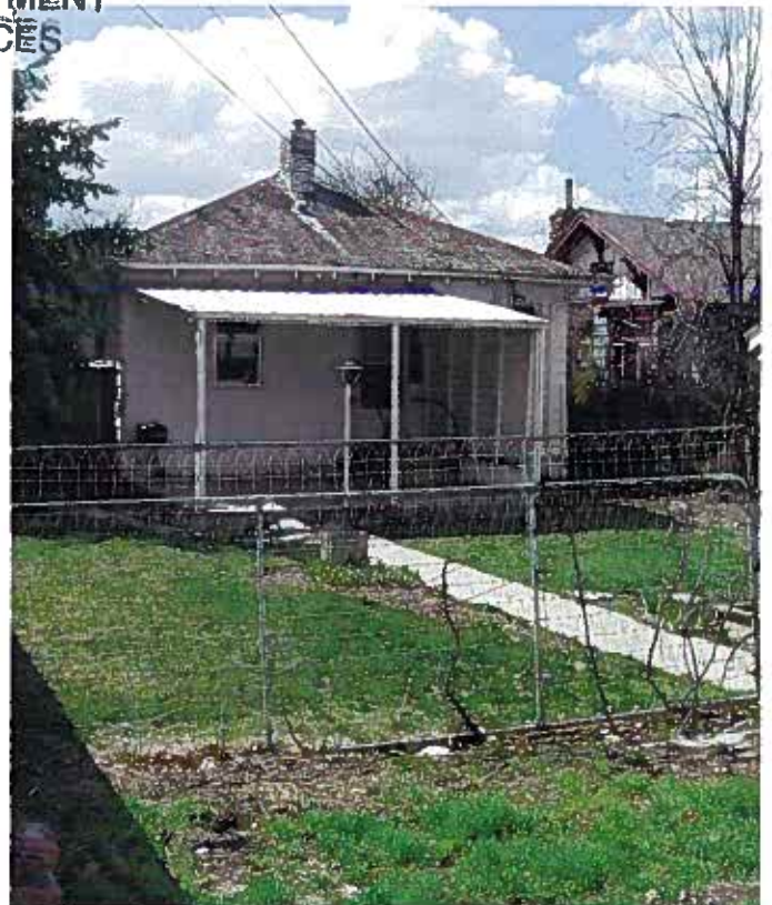
Back of house directly East of home