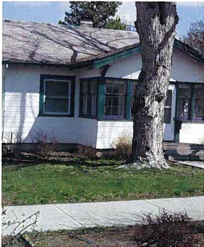
Same block. East of home