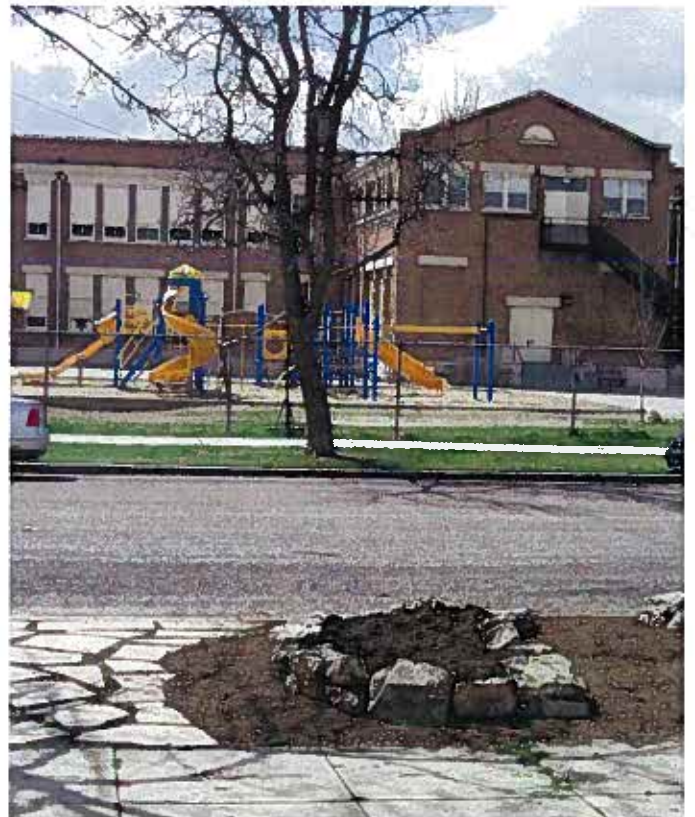
Across State street. Back playground of elementary school. Taken from steps of our home.