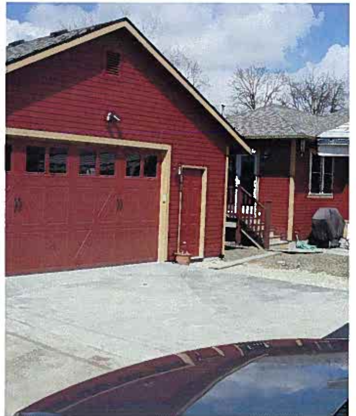
Directly behind existing home. Across alley.