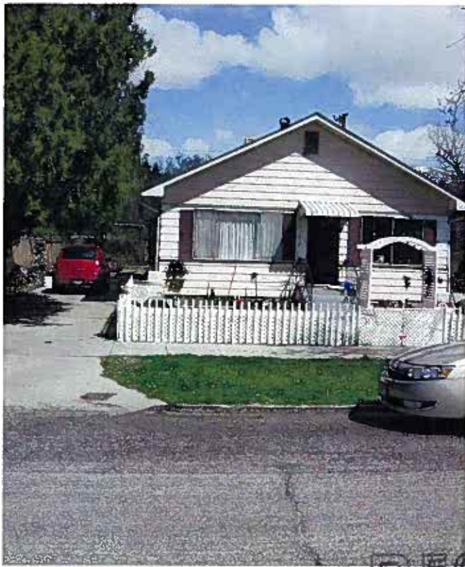
Front of house directly West of home