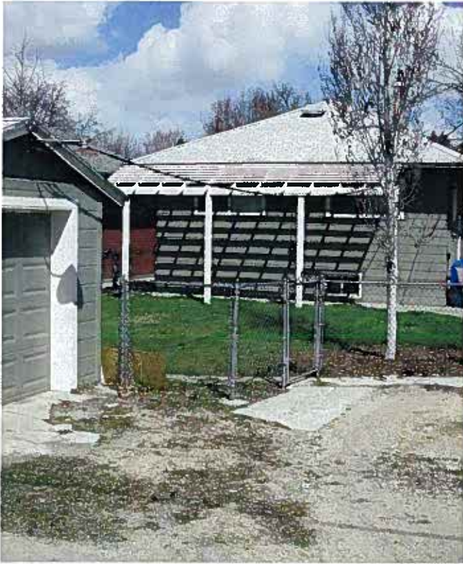
Across alley in back of home.