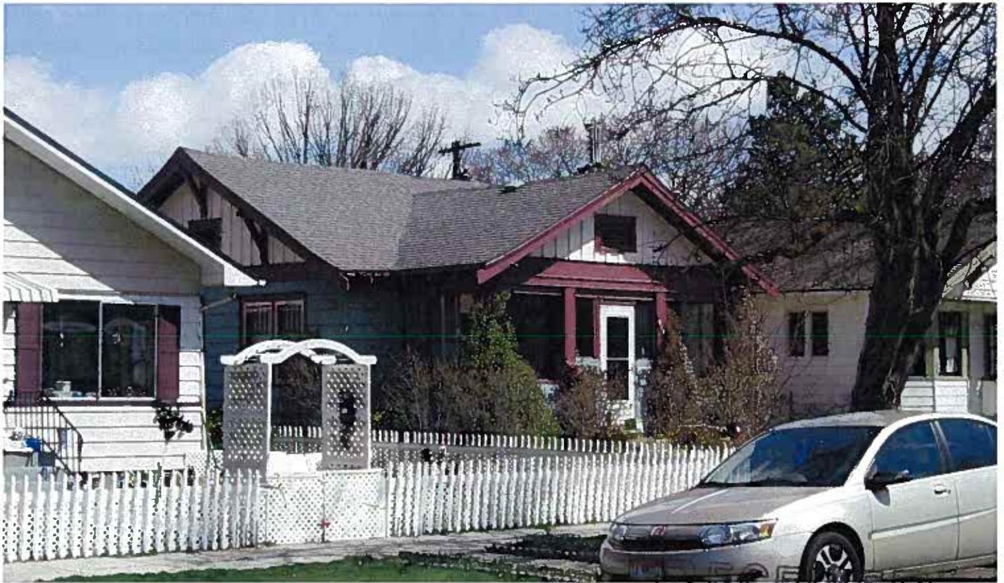
Front left side of existing home.