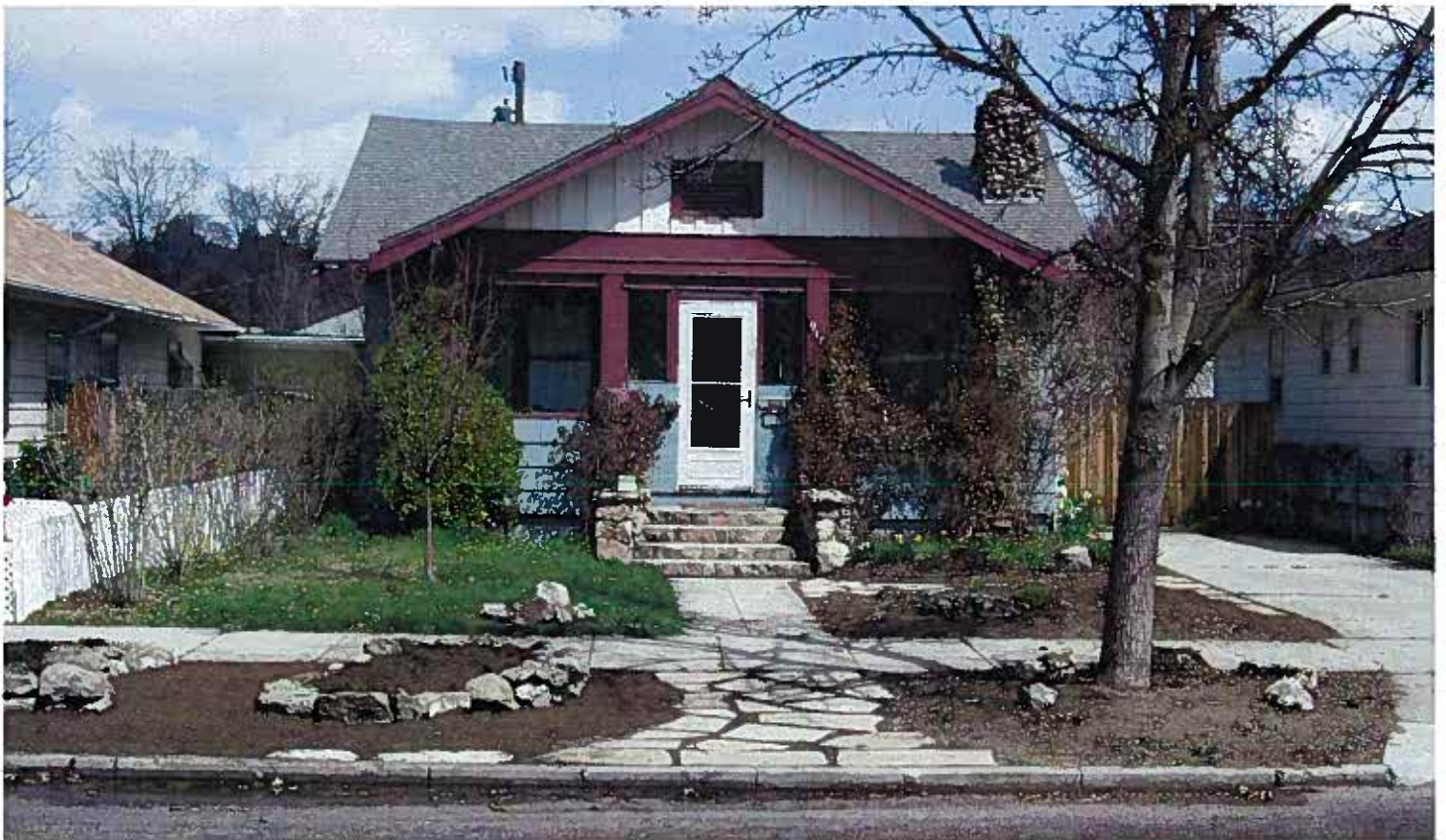
Front of existing home