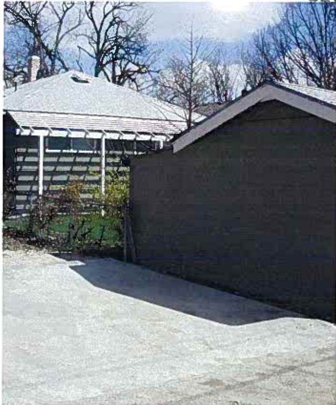
Across alley (North East) of home