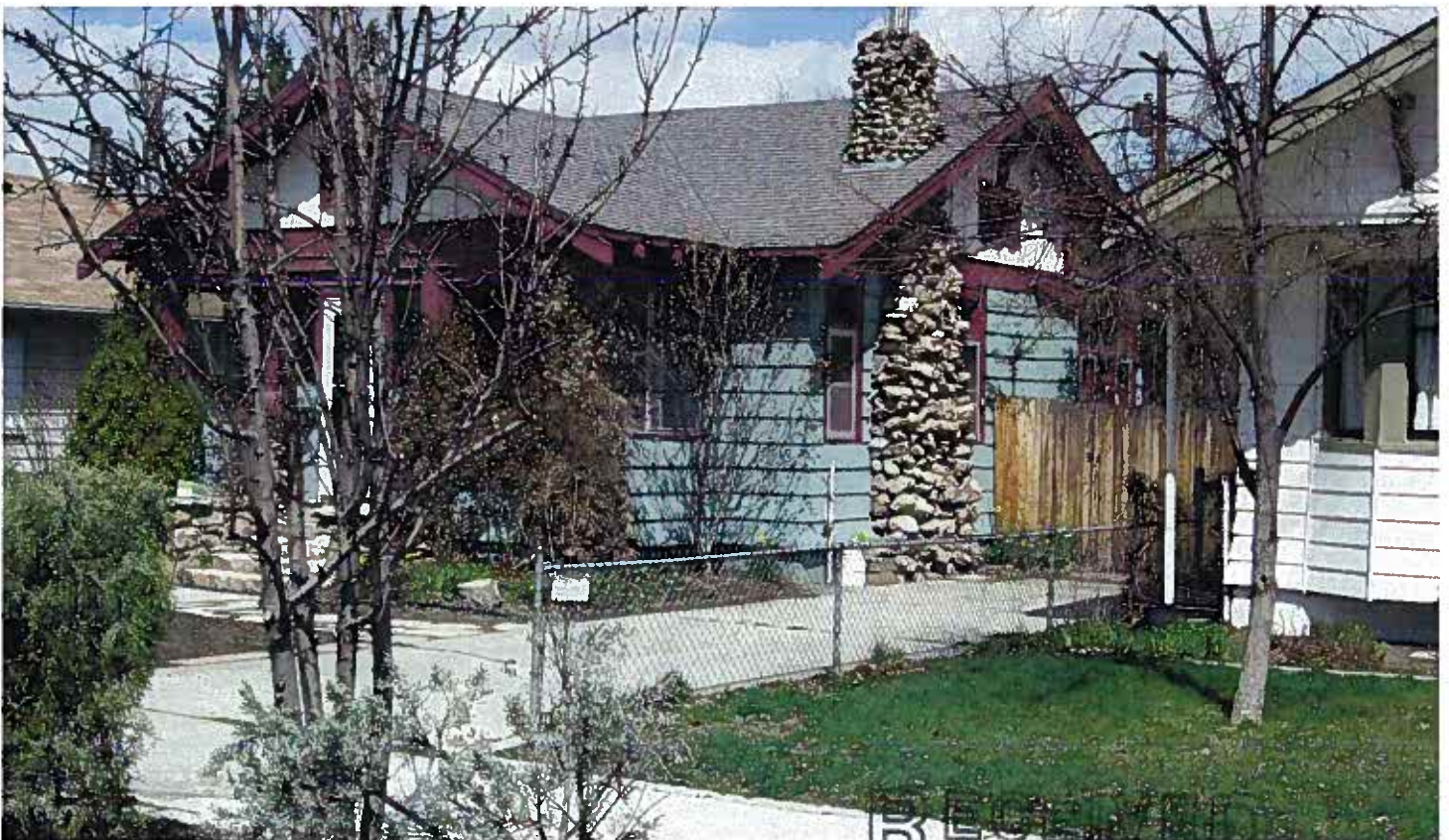
Front right side of existing home.