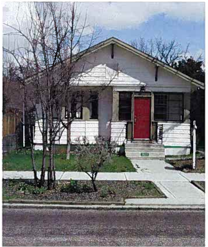
Front of house directly East of home