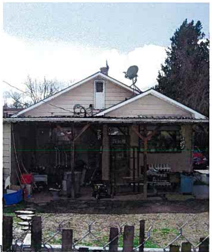
Back of house directly West of home