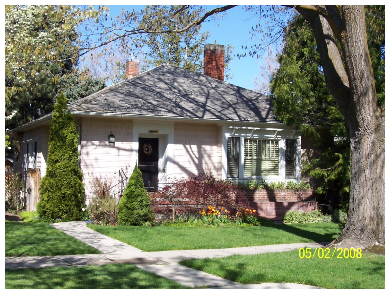
Front Elevation (east)