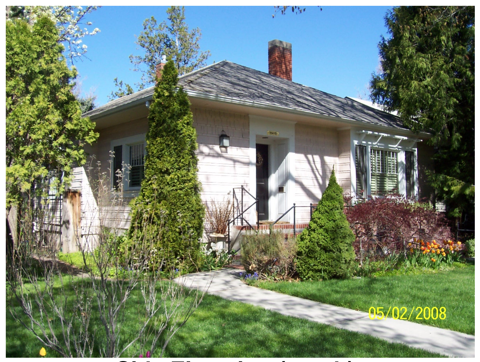
Side Elevation (south)