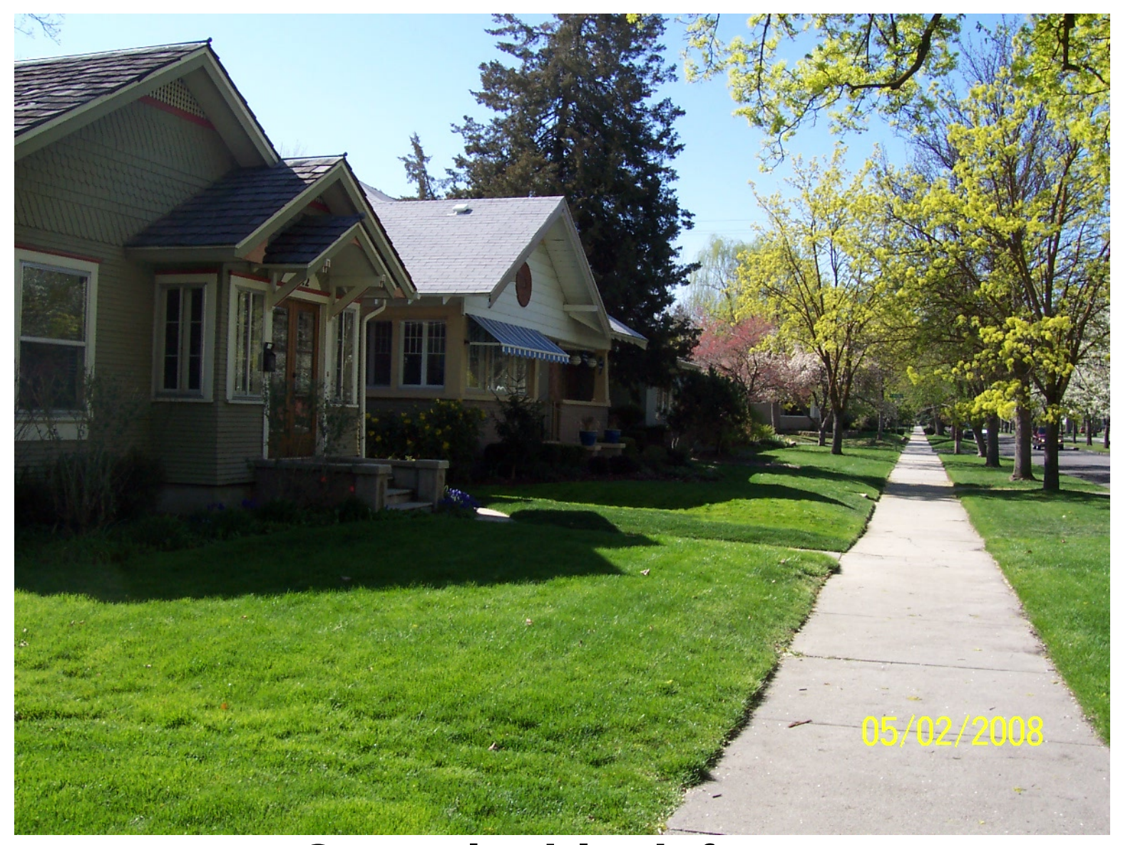
Opposite block face