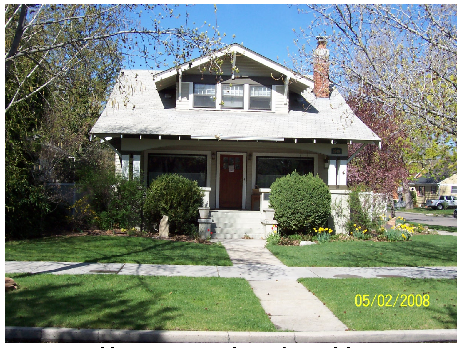
House next door (south)