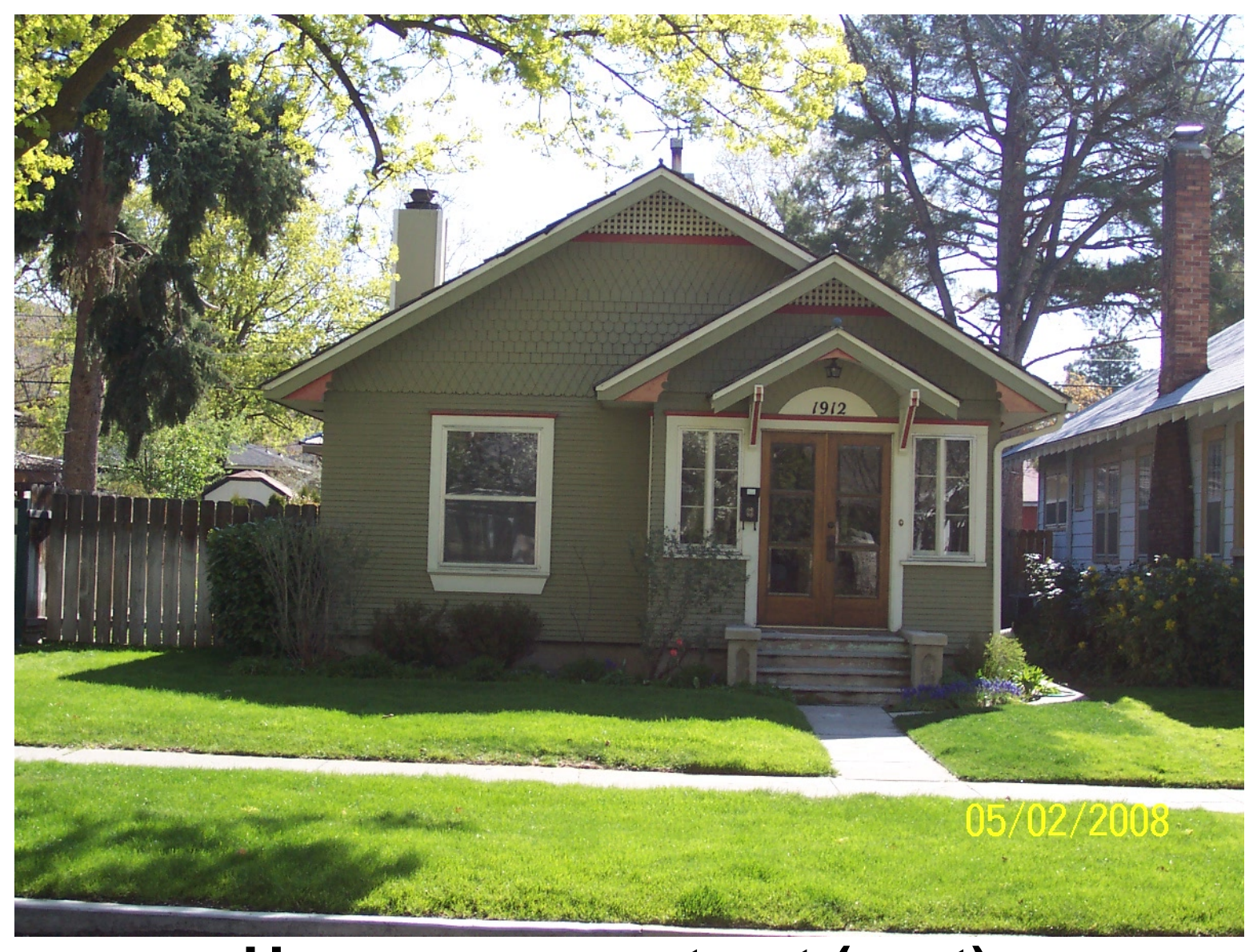
House across street (east)