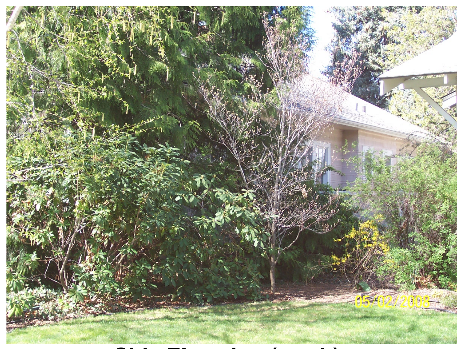
Side Elevation (north)