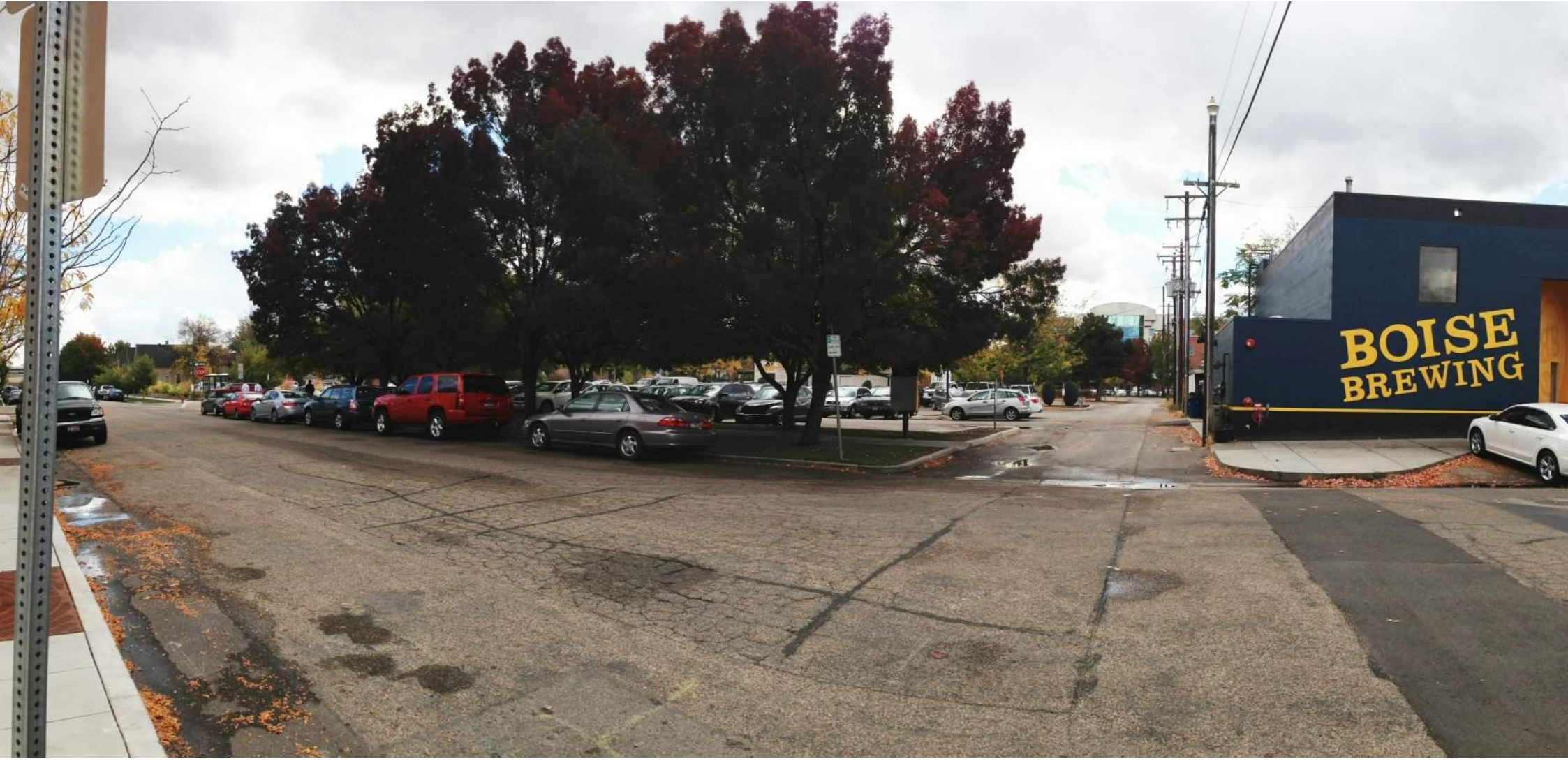
NORTH CORNER OF SITE - (E) SURFACE PARKING LOT