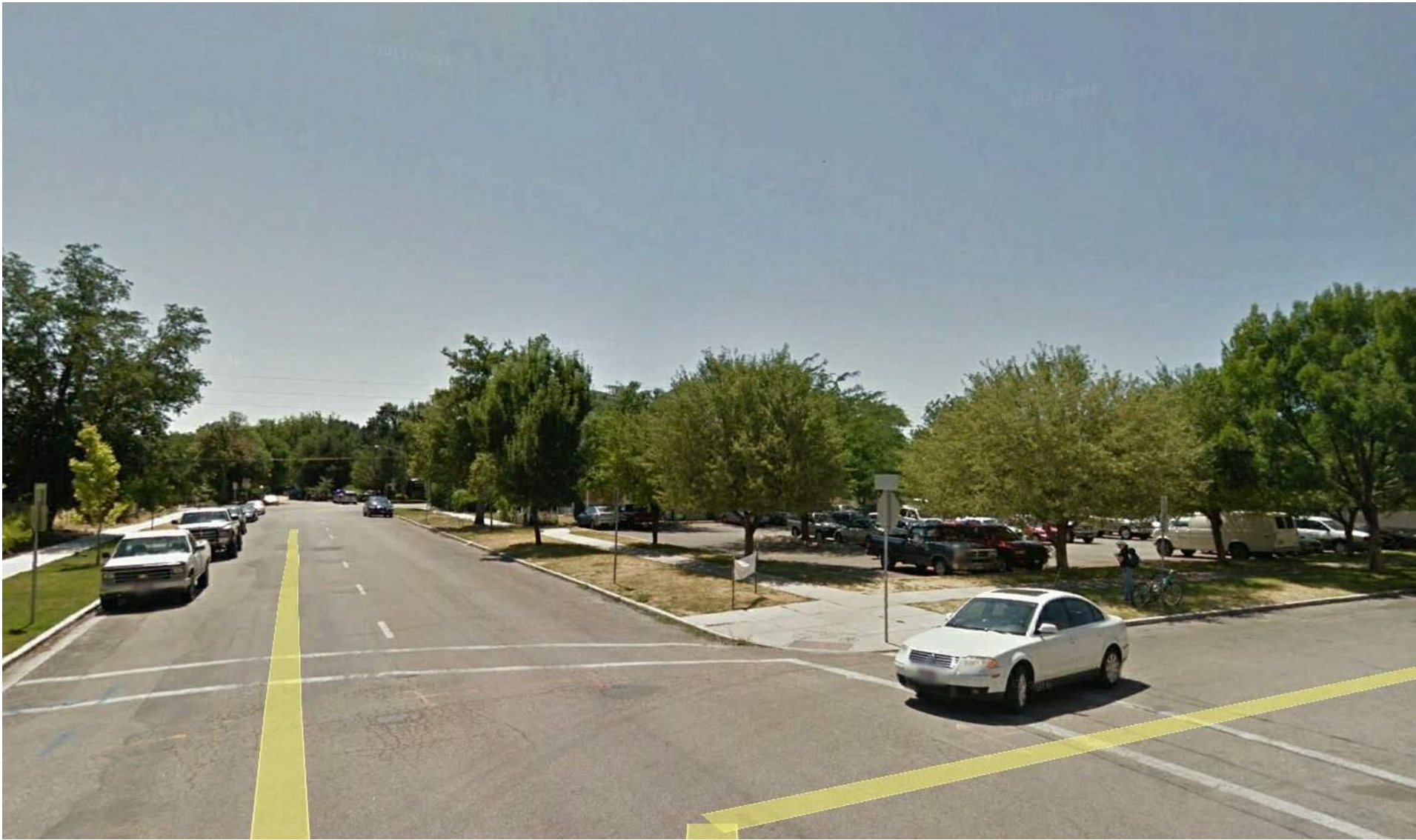
EAST CORNER OF SITE - 5TH AND BROAD - (E) SURFACE PARKING LOT