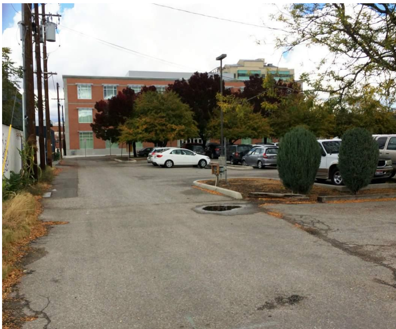
NORTHWEST SIDE OF SITE - VIEW DOWN (E) ALLEYWAY