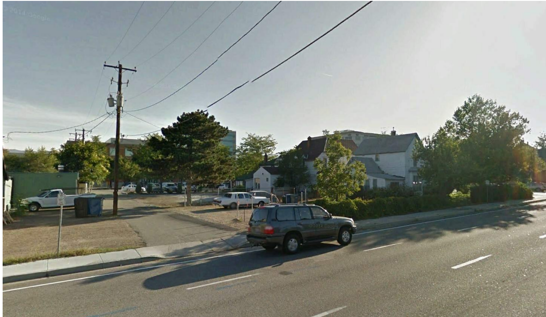
SOUTHWEST SIDE OF SITE - MYRTLE STREET - (E) STRUCTURES AND (E) ALLEYWAY