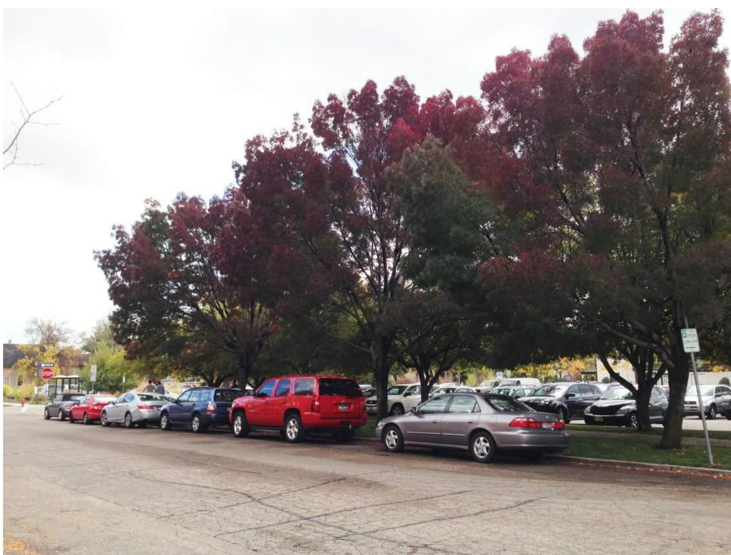
NORTHEAST SIDE OF SITE - BROAD STREET - (E) SURFACE PARKING LOT