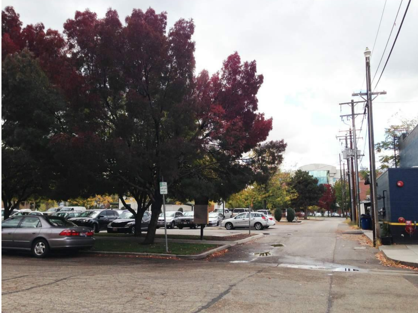
NORTH CORNER OF SITE - VIEW OF (E) ALLEYWAY