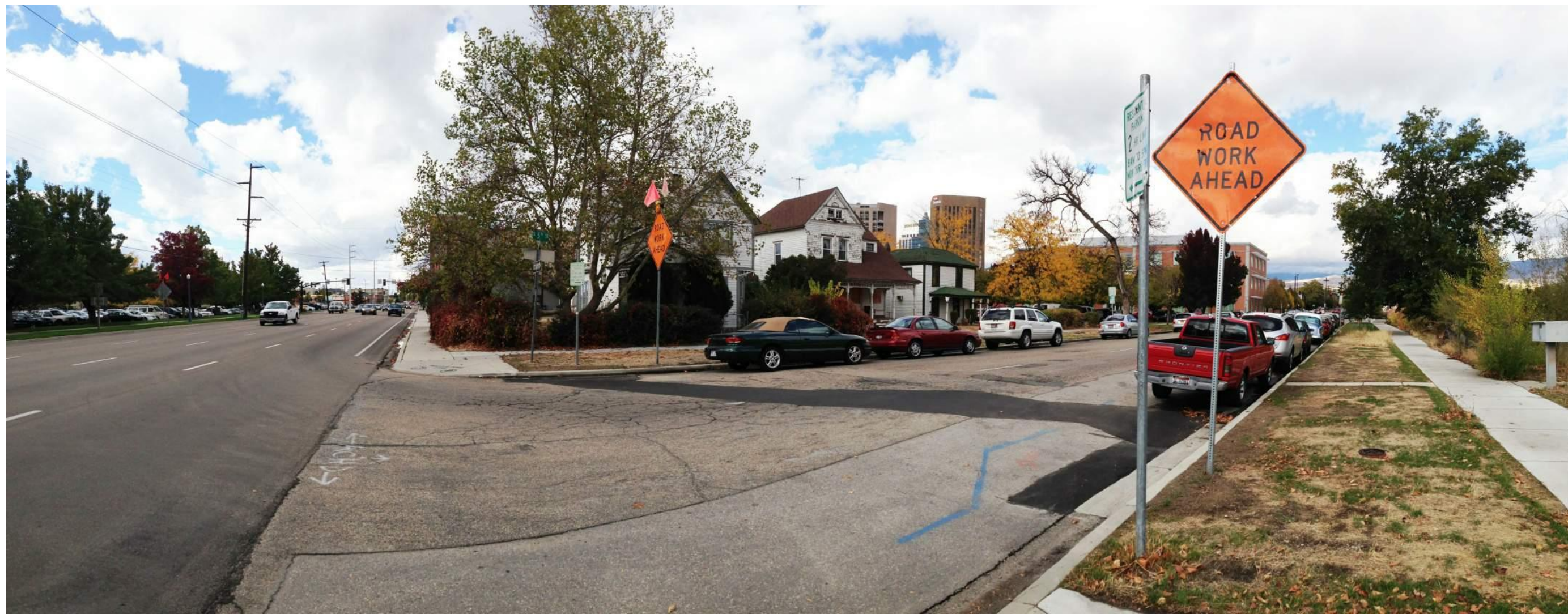
SOUTH CORNER OF SITE - 5TH AND MYRTLE - (E) HOUSES