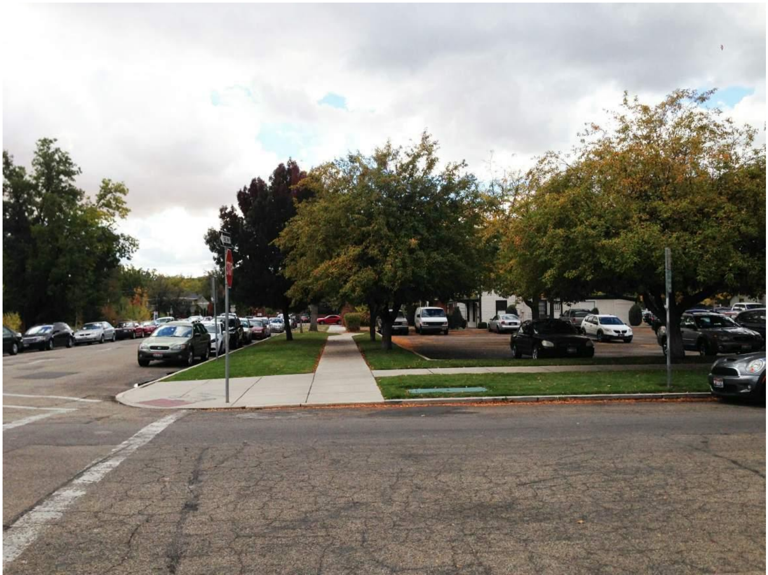
EAST CORNER OF SITE - (E) SURFACE PARKING LOT