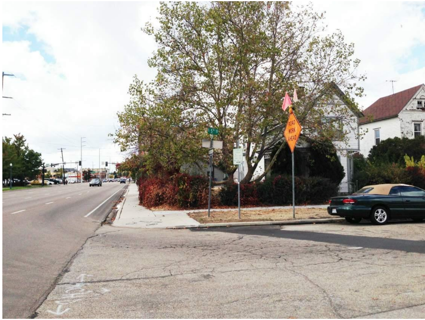
SOUTH CORNER OF SITE - (E) HOUSES