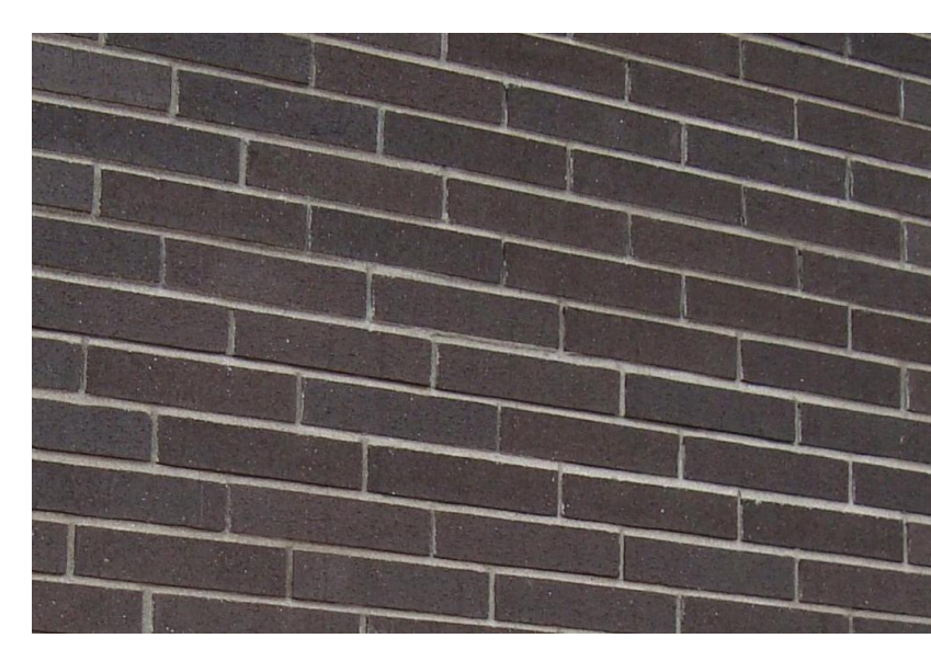
"MIDNIGHT BLACK" BRICK VENEER, BRICK SIZE 2 1/2" X 7 1/2" X 3 1/2"