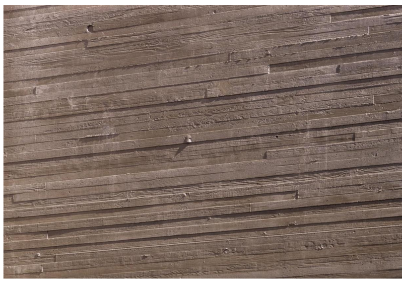
<u>CN-1</u> CAST IN PLACE, BOARD FORMED CONCRETE, STAINED AND SEALED