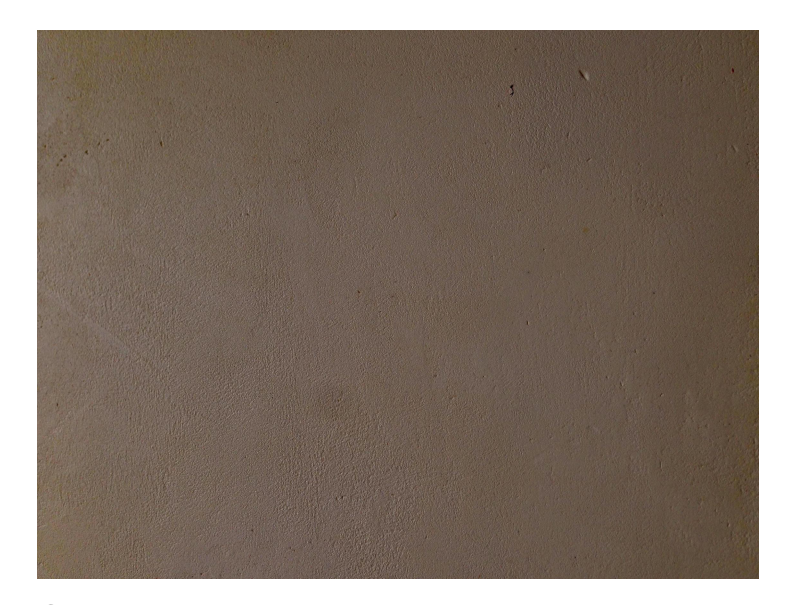
<u>ST-1</u> INTEGRAL COLOR ACRYLIC STUCCO SMOOTH FINISH