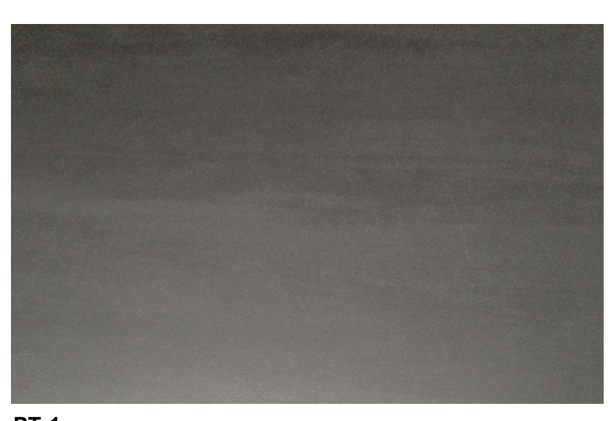
THRU BODY PORCELAIN TILE, 3/8" THICK X 12" X 24" STACKED BOND PATTERN