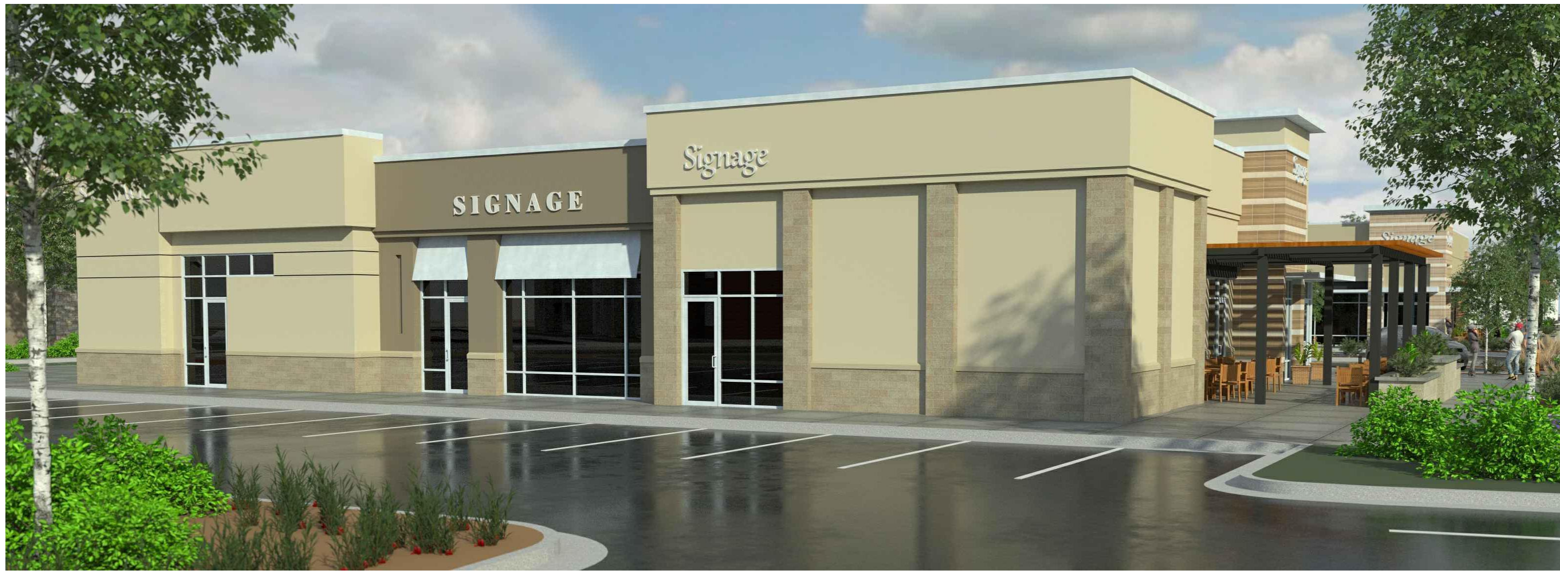
R3 RENDERING: LOOKING EAST ALONG STATE STREET