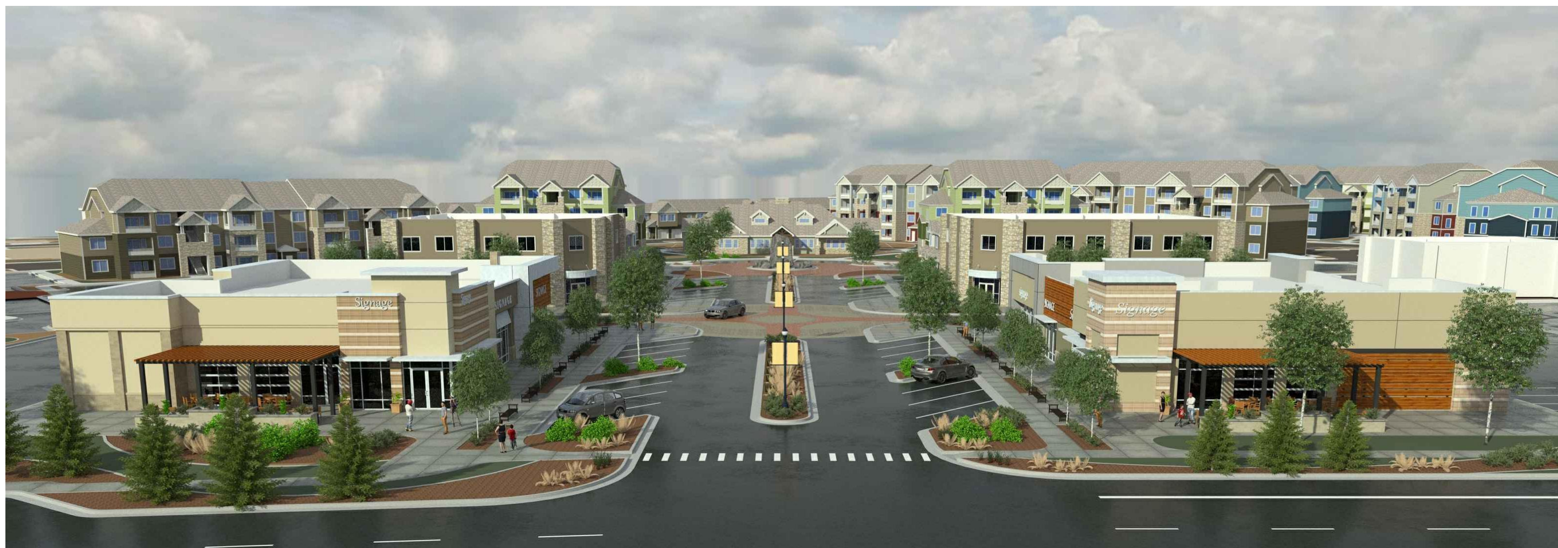
R2 RENDERING: LOOKING UP BOULEVARD FROM STATE STREET