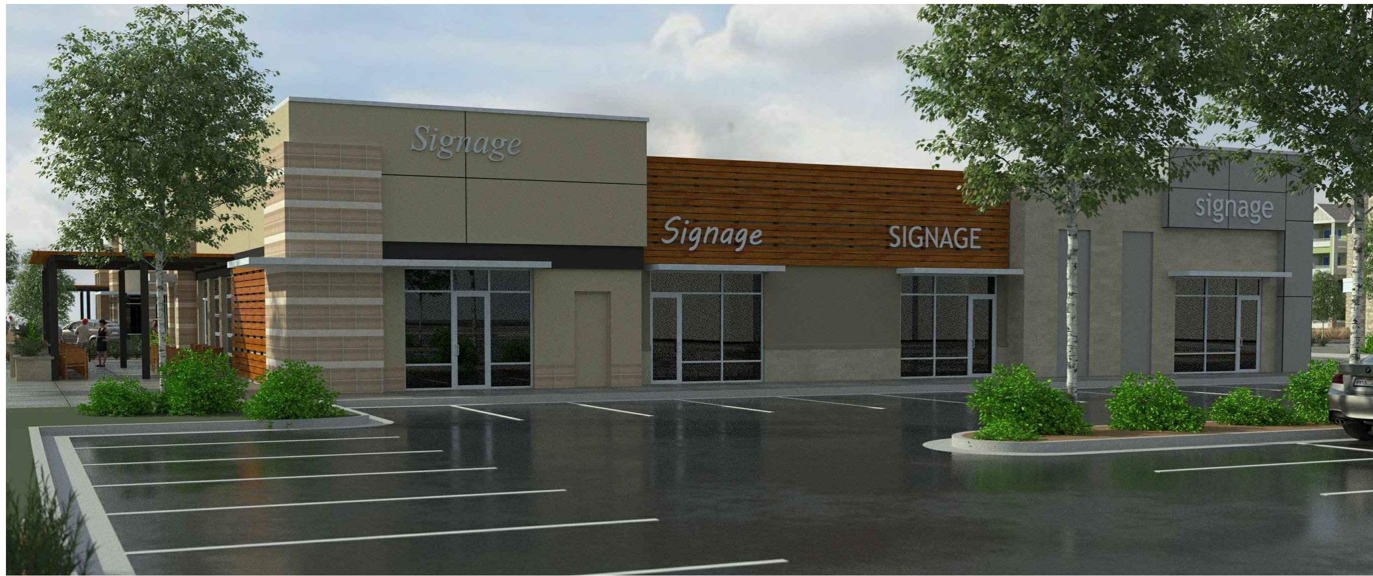
R4 RENDERING: LOOKING WEST ALONG STATE STREET