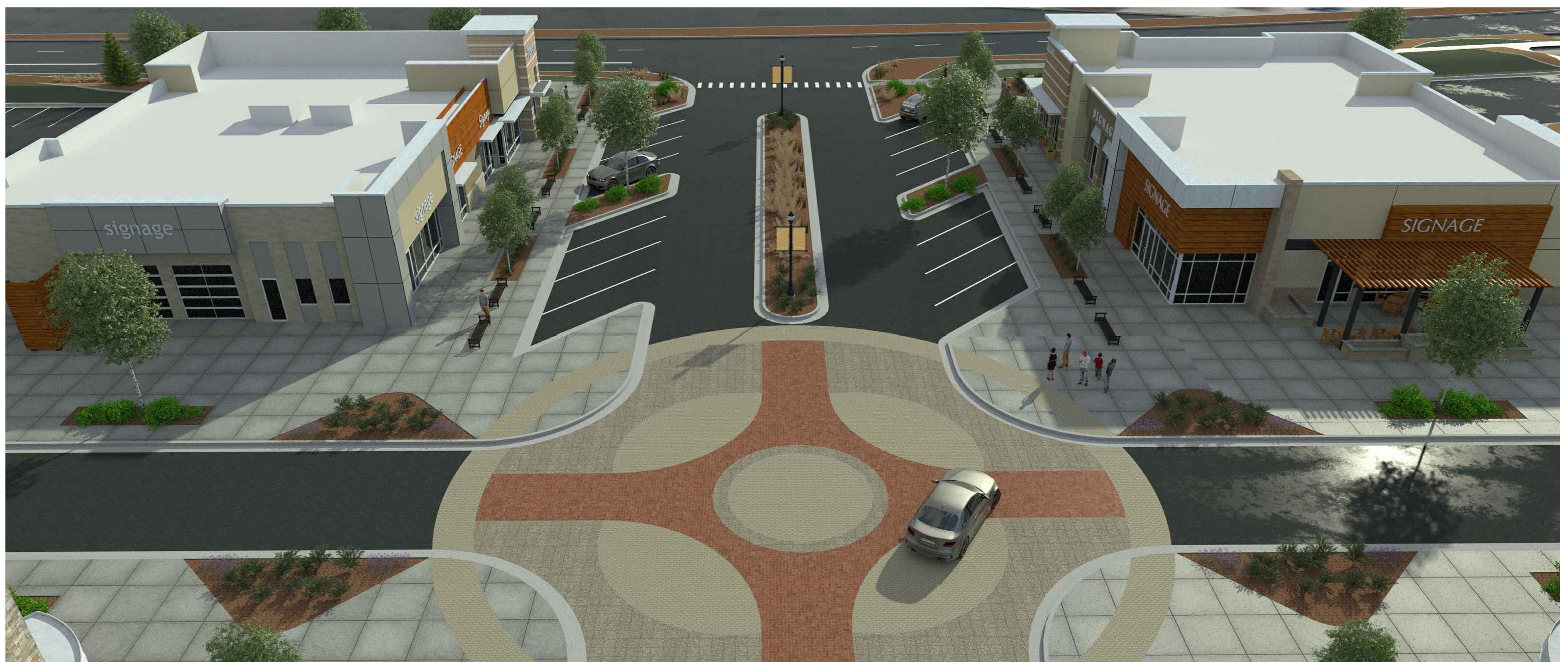
R1 RENDERING: LOOKING DOWN BOULEVARD TOWARD STATE STREET