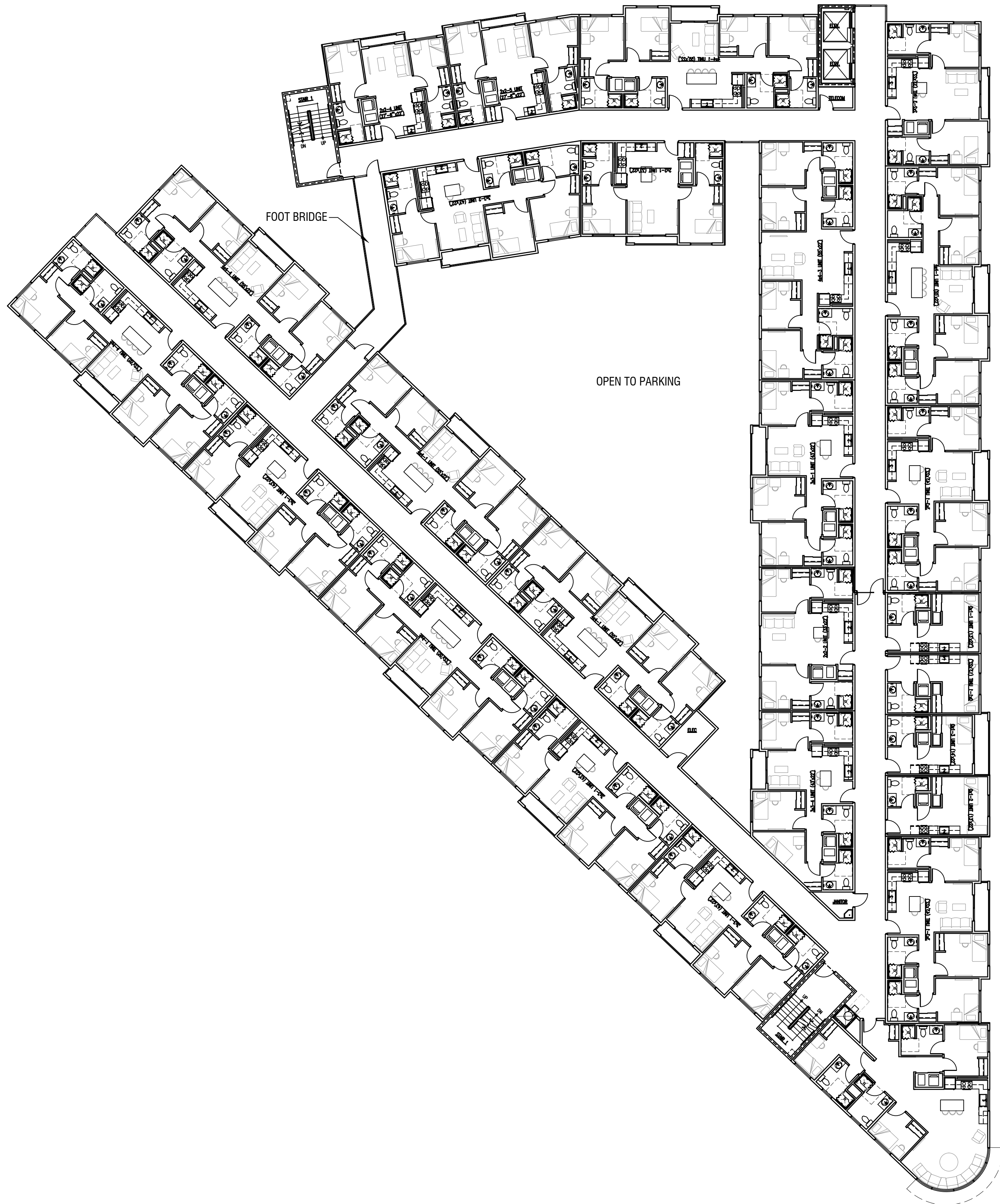
1 2ND-4TH LEVEL FLOOR PLAN SCALE: 1/16" = 1'-0"