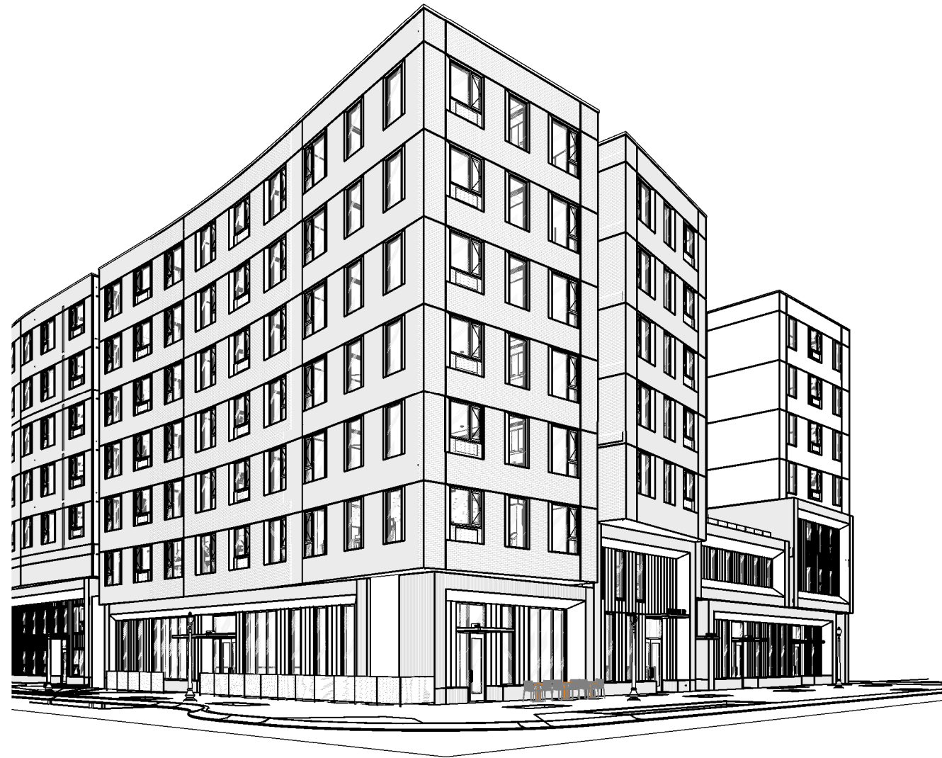
4. VIEW FROM 5TH & BROAD - NE CORNER