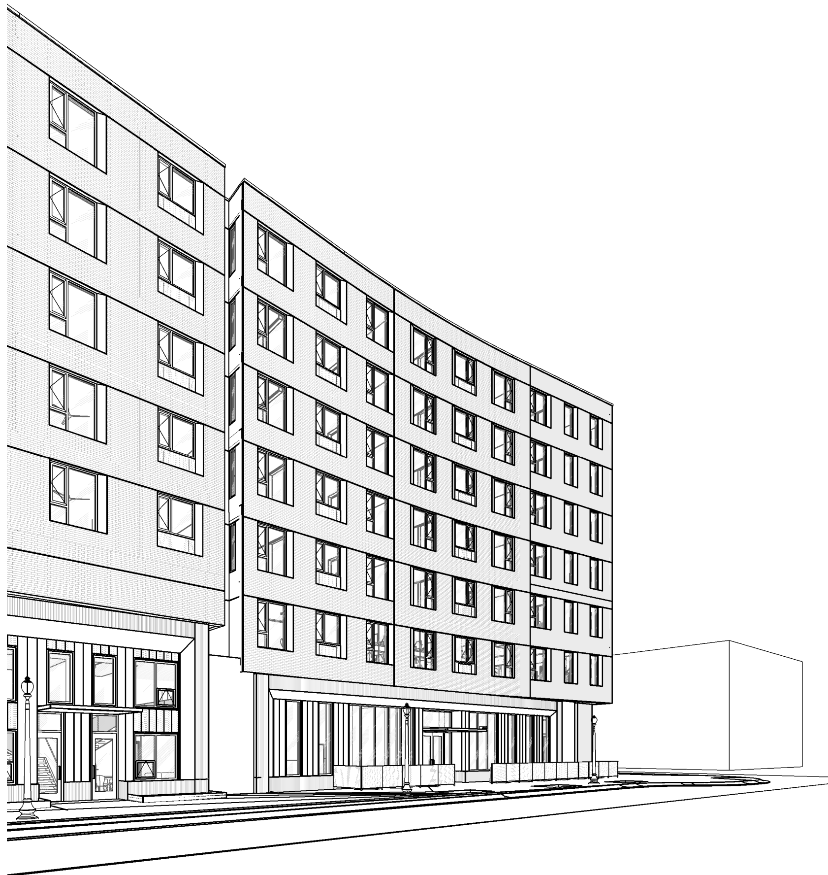
5. VIEW FROM 5TH - ACROSS STREET