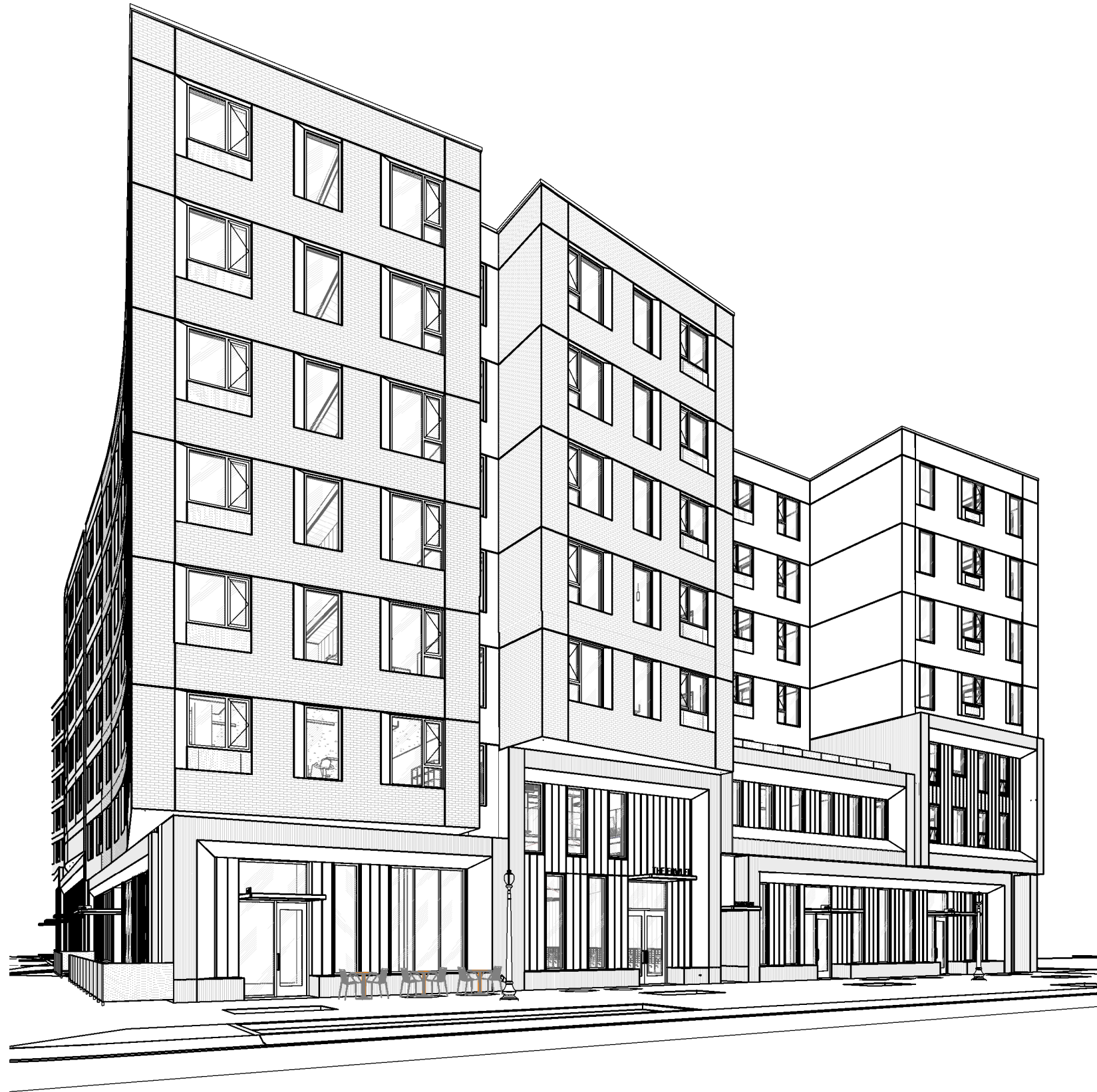
3. VIEW FROM 5TH & BROAD - NW CORNER