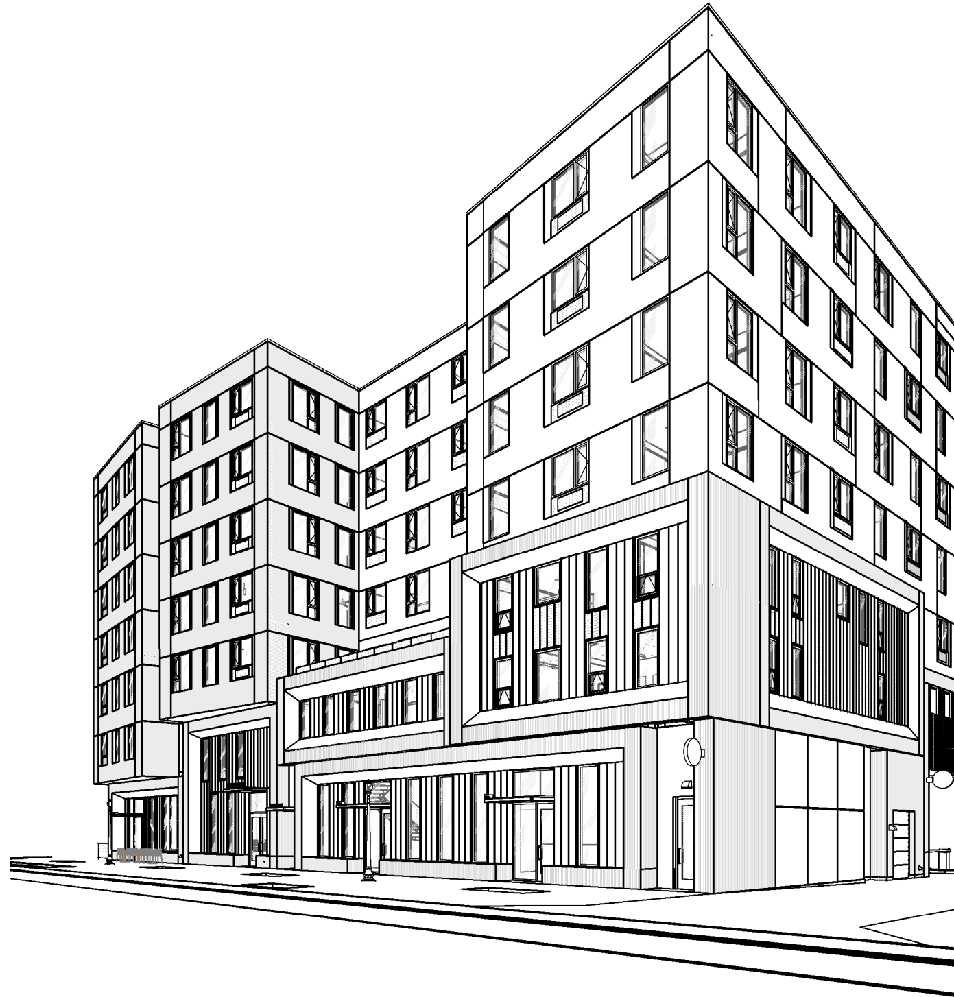
1. VIEW FROM ALLEY & BROAD