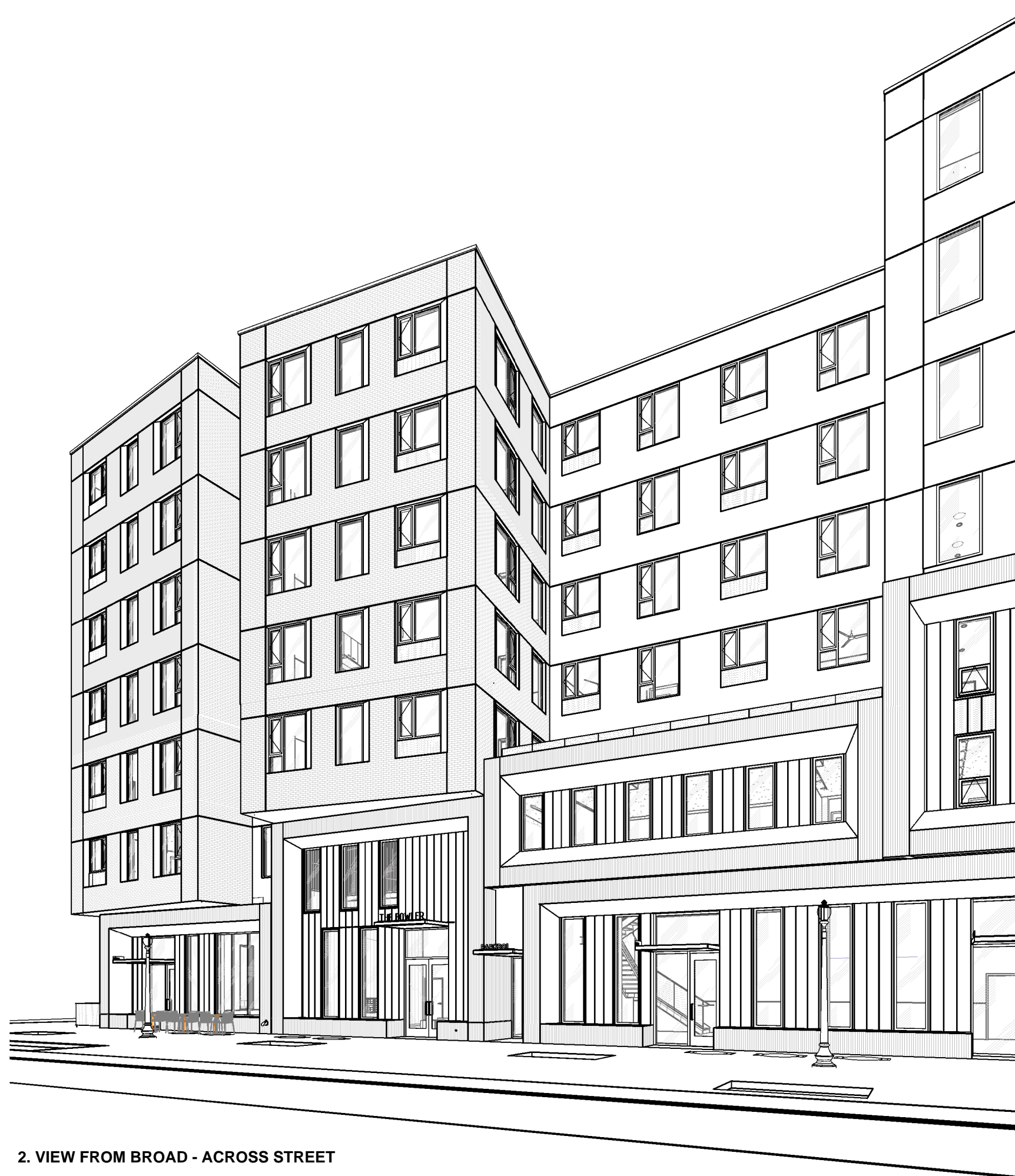
2. VIEW FROM BROAD - ACROSS STREET