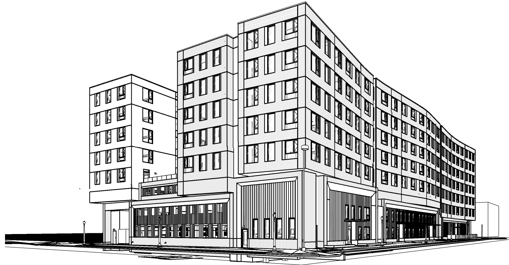
6. VIEW FROM 5TH & MYRTLE - SE CORNER