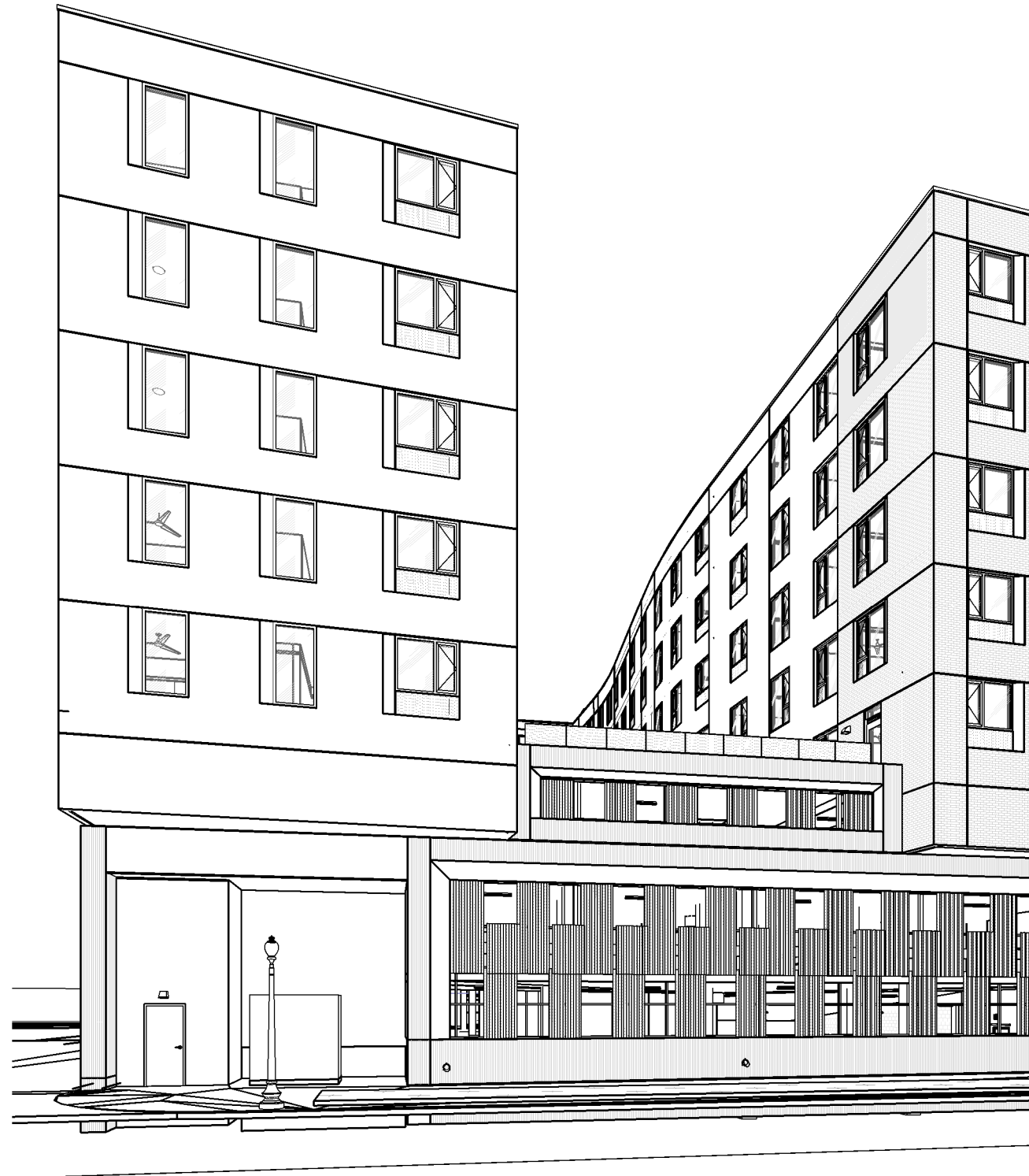
7. VIEW FROM MYRTLE - ACROSS STREET