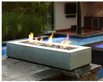
PREFABRICATED FIRE PIT