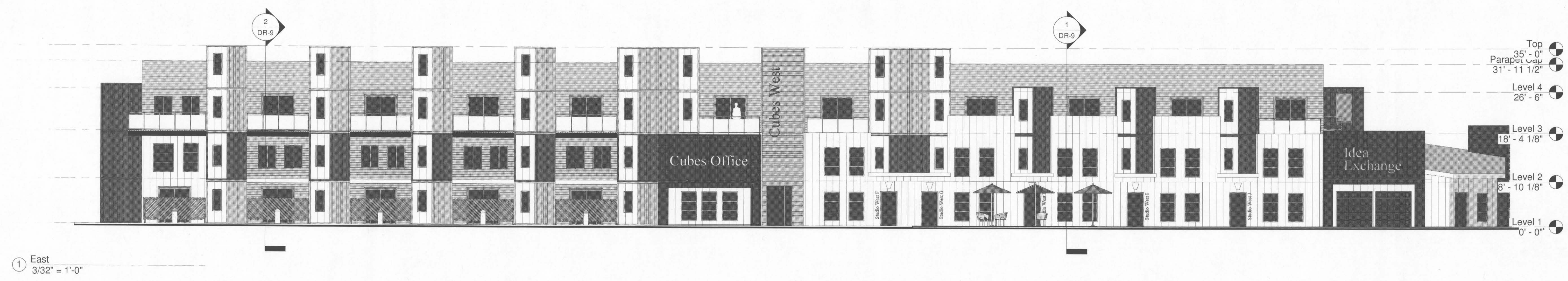
① East 3/32" = 1'-0"

DR-7 Scale: 3/32" = 1'-0" Plot Date: 6/6/2011 1:47:34 PM