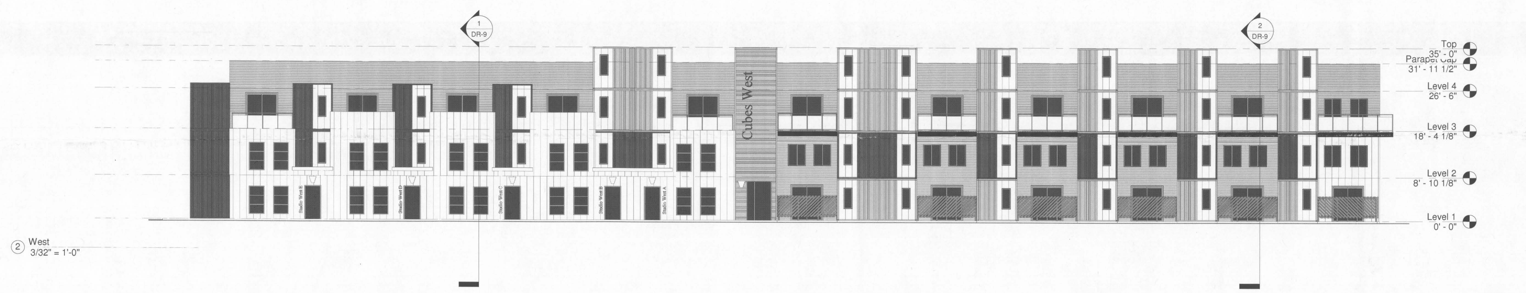
② West 3/32" = 1'-0"