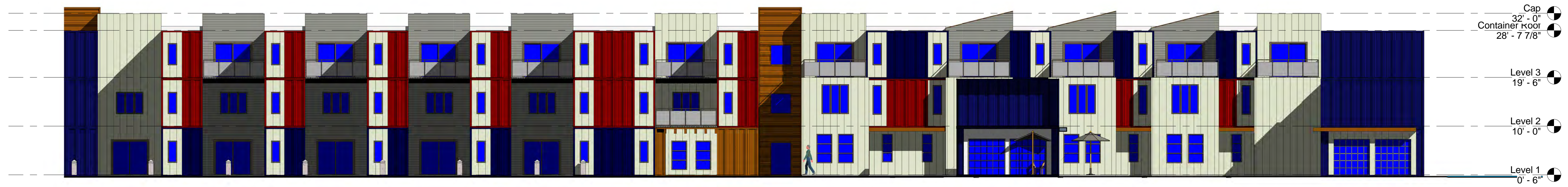
① East 3/32" = 1'-0"

Scale: 3/32" = 1'-0" Plot Date: 7/21/2011 1:15:06 PM