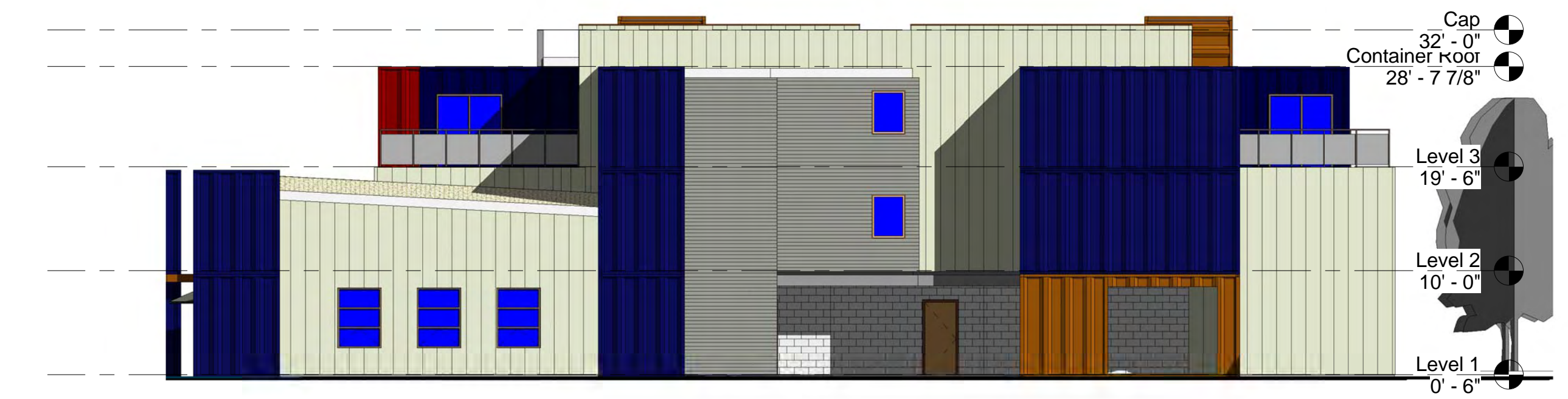
③ North 3/32" = 1'-0"