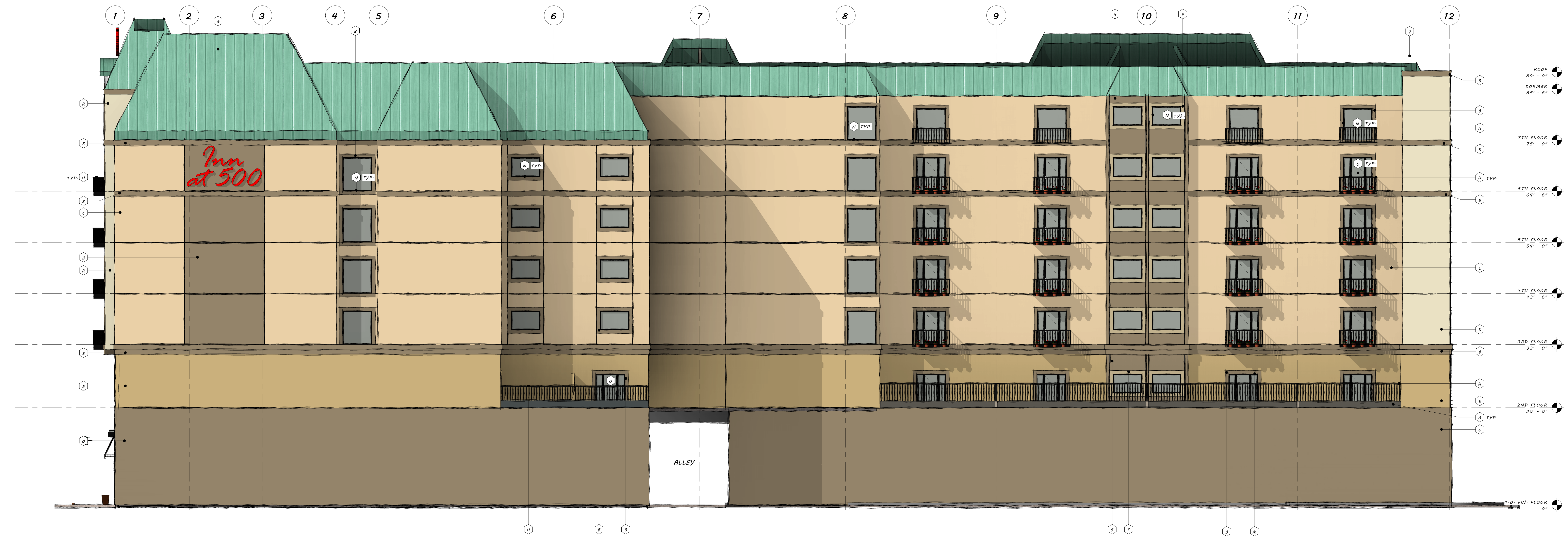
2 SOUTH ELEVATION 1/8" = 1'-0"