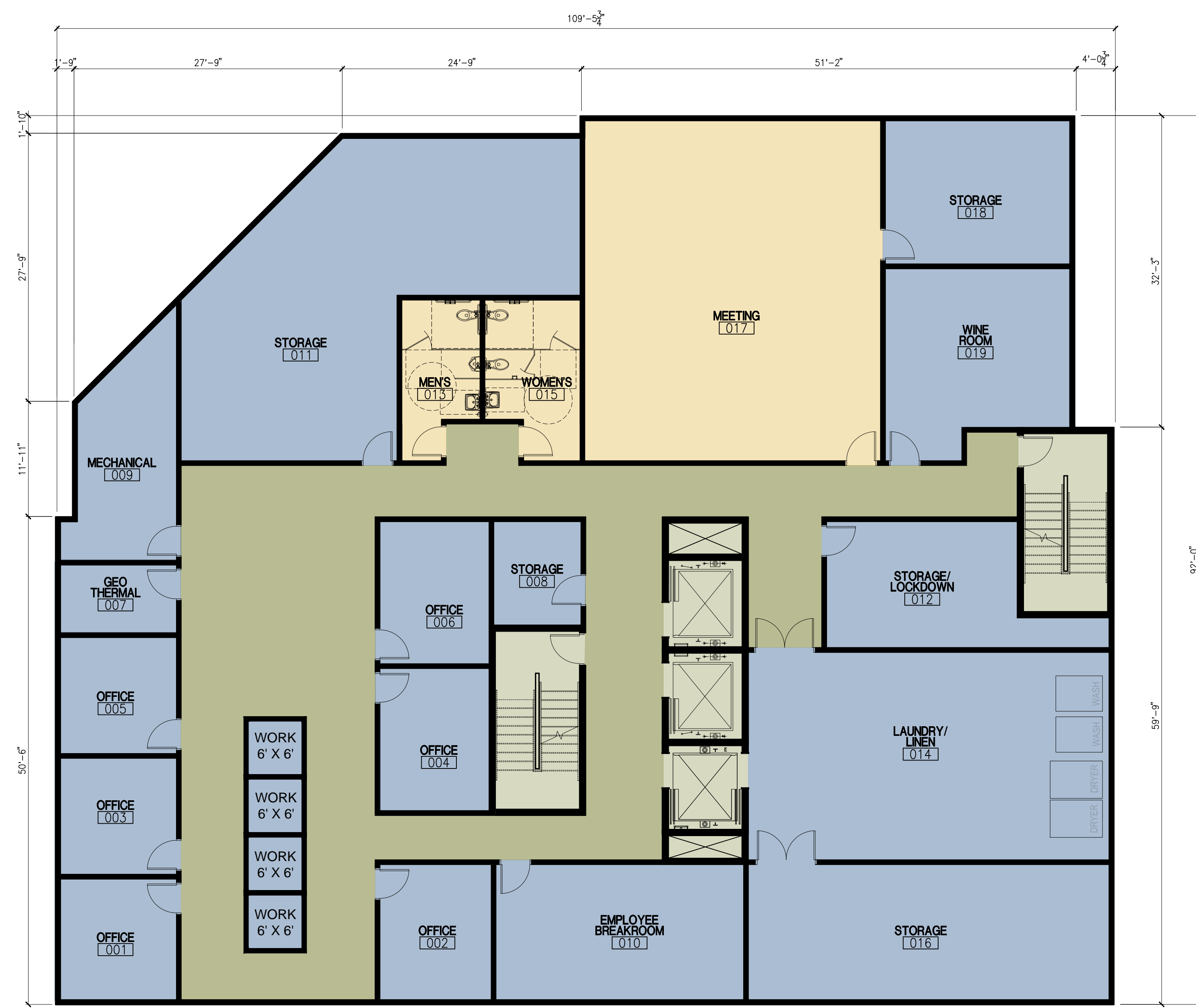
1 BASEMENT FLOOR PLAN SCALE: 1/8" = 1'-0"