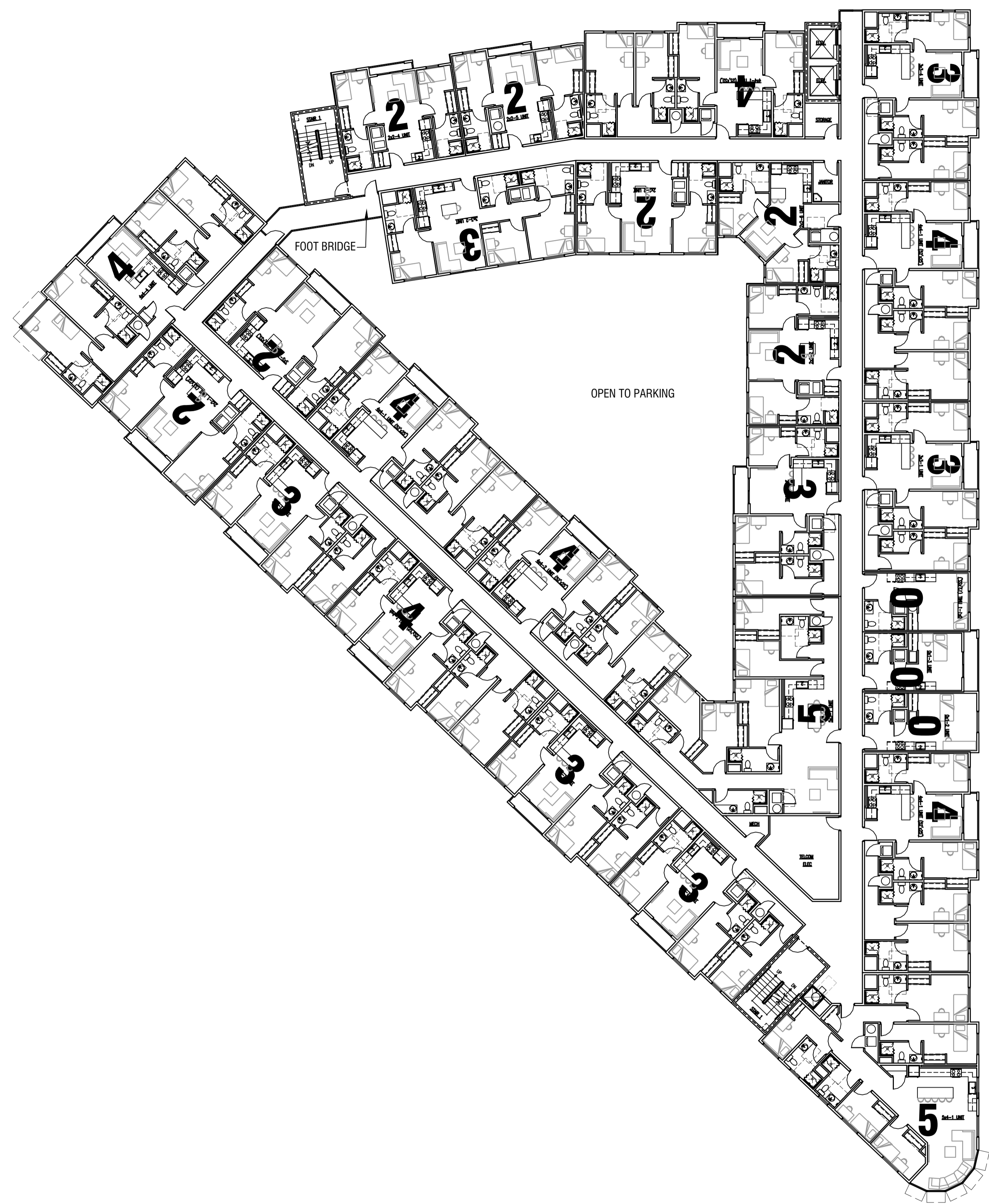
1 2ND-4TH LEVEL FLOOR PLAN SCALE: 1/16" = 1'-0" NORTH