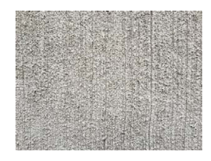
Lower "combed" stucco texture

We have incorporated the careful use of the stucco, with a limited and subdued color palette, with accenting materials of glass, metal and concrete to create a harmonious and visually appealing building suitable for the prominent site.