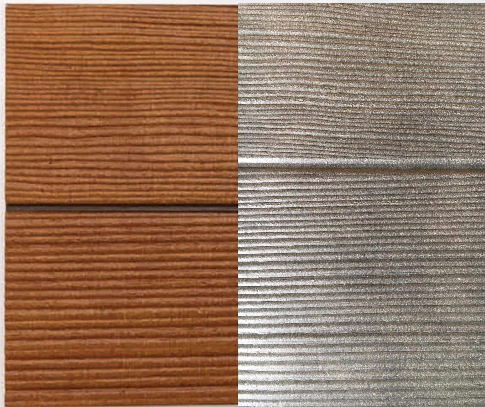
FIBER CEMENT BOARD PANEL